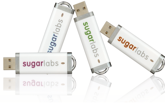
Figure 2: Sugar on a stick. Left: The One Laptop Per Child project (OLPC) project provides children in the developing world with computers, so as to support their learning with Open Educational Resources and to prepare them for a life in an interconnected world. Source: http://wiki.laptop.org/go/File:Bucolico-full.jpg . License: CC-BY-SA . Right: Sugar – the Fedora-based operating system specifically designed for OLPC computers – is available on USB keys to facilitate development, testing and outreach. We want to create a variant of such sticks that hosts medical information distilled from the Encyclopaedia of original research in a way compatible with inclusion in OLPC deployments. Source: http://wiki.sugarlabs.org/go/File:SugaronastickMirabelle.png . License: CC-BY .