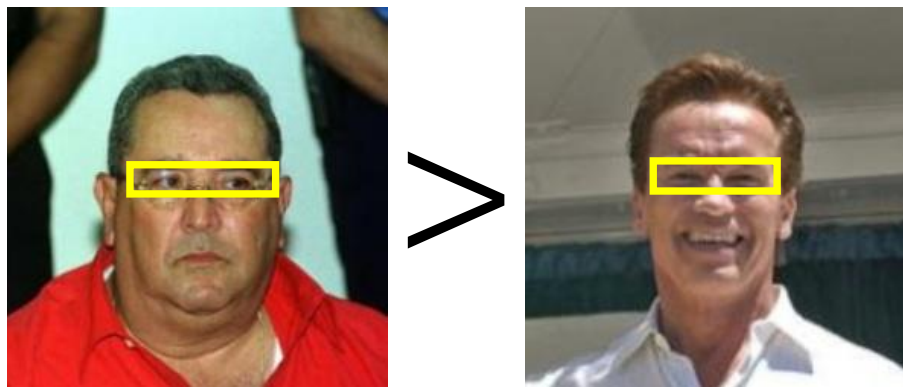
(b) Human annotated relevant regions