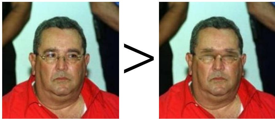
(c) New augmented constraint A > A'