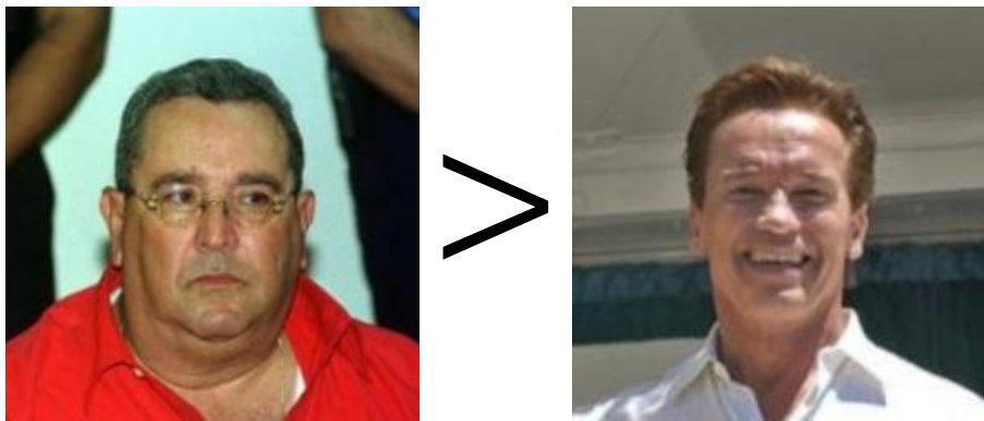
(a) Training images A and B, with A > B for attribute “eyes open”