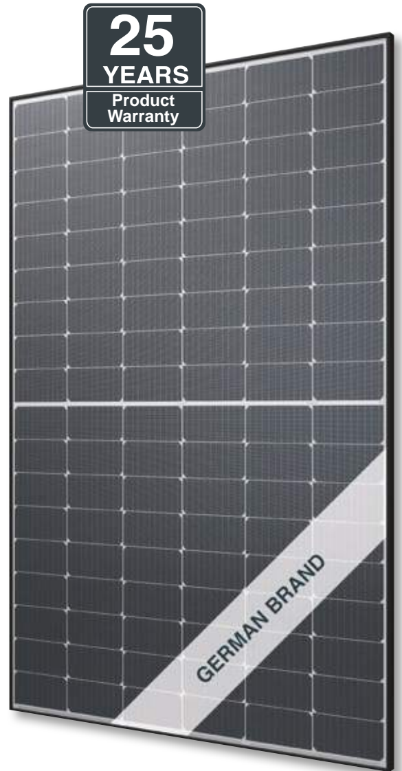
Fig. similar 08MH-AUS20905A

*Subject to the terms and conditions contained in the applicable AXITEC Energy Australia Pty Ltd Warranty Statement. This 25-year limited product warranty is only available for residential rooftop installations within Australia with a maximum capacity of 40 kWp.