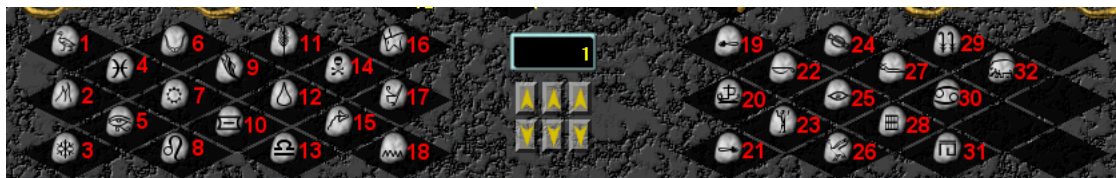
Figure 13.1.: The runes

Casting a spell is done by selecting one or more runes and eventually selecting a target. We assign numbers to these runes like in fig(13.1). Every spell gets a unique spell-ID which is entirely determined