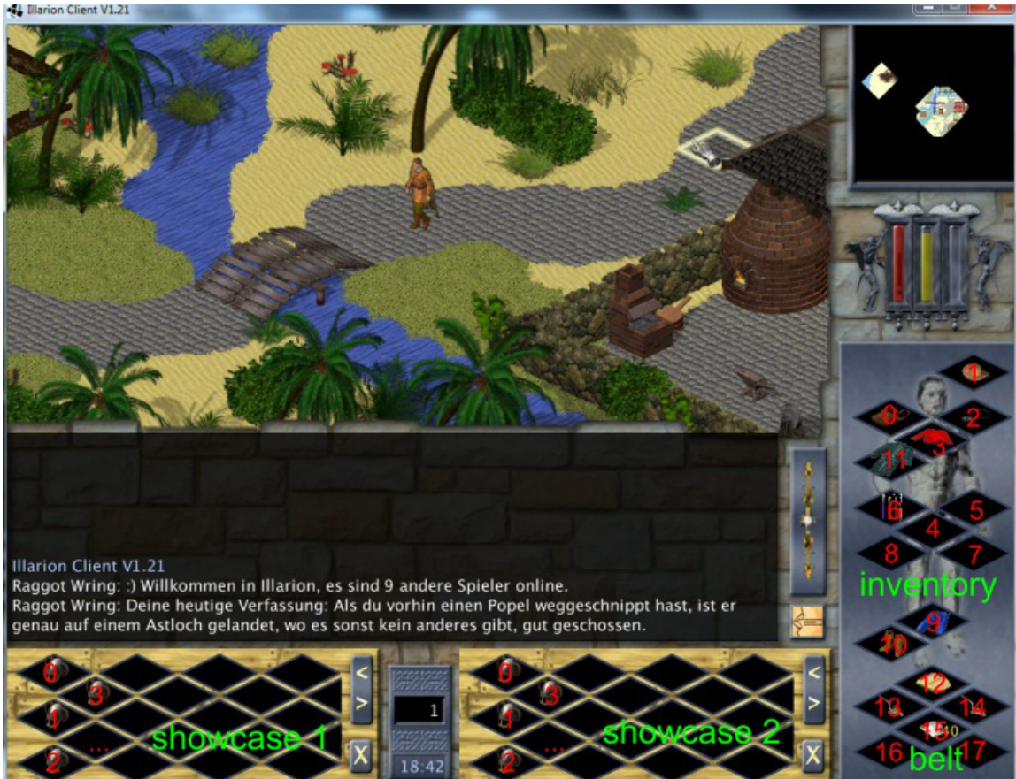
Figure 8.1.: Illustration for positions of items. Red: itempos , Green: getType