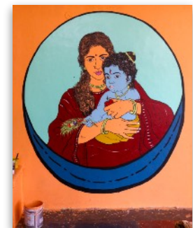
Another mural by Viji

The Girls' accommodation now looks in much need of attention and the compound wall down the side of this building will have to be rebuilt to ensure site security. There is also the question of the vehicle which is used for so many purposes. It is a very small people-carrier which was bought second-hand eight years ago. It is not strong enough to be used for the necessary hill village trips, and its transmission is becoming noisy. Around the vicinity of the home it is in daily use for school and shopping trips. It will have to be replaced soon. These three expensive projects are essential for the future of the home, and we need your continued support.