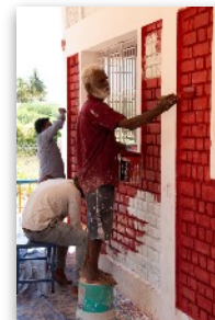
The Boss Painter

The Boys' accommodation is also looking good with its covered 'stage', the access ramp and front rail for safety, and the new large space on the roof with its metal structure supporting the roof and walls. The interior wall linings of this have to be completed before it can be used but it has great potential as another multi-purpose room. The compound wall which runs alongside the rear of this building has been repaired and rendered up to the new gate which is yet to be completed for use. This new access to the site will be for kitchen and commercial deliveries. The gate used at present will remain solely for children and visitors to the home to improve the safety of the whole site.