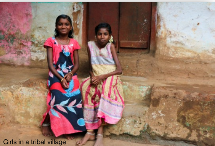
Girls in a tribal village

through a children's home (not Awake), and from his brother has learned that Awake offers children the best care and access to education of any similar institution. I feel that at least Awake children do have a much wider scope of opportunities after school, but there is always going to be some who will prefer to return to their home background and use their skills to improve the environment there.