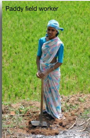
Paddy field worker