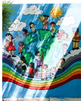
....and one of her masterpieces