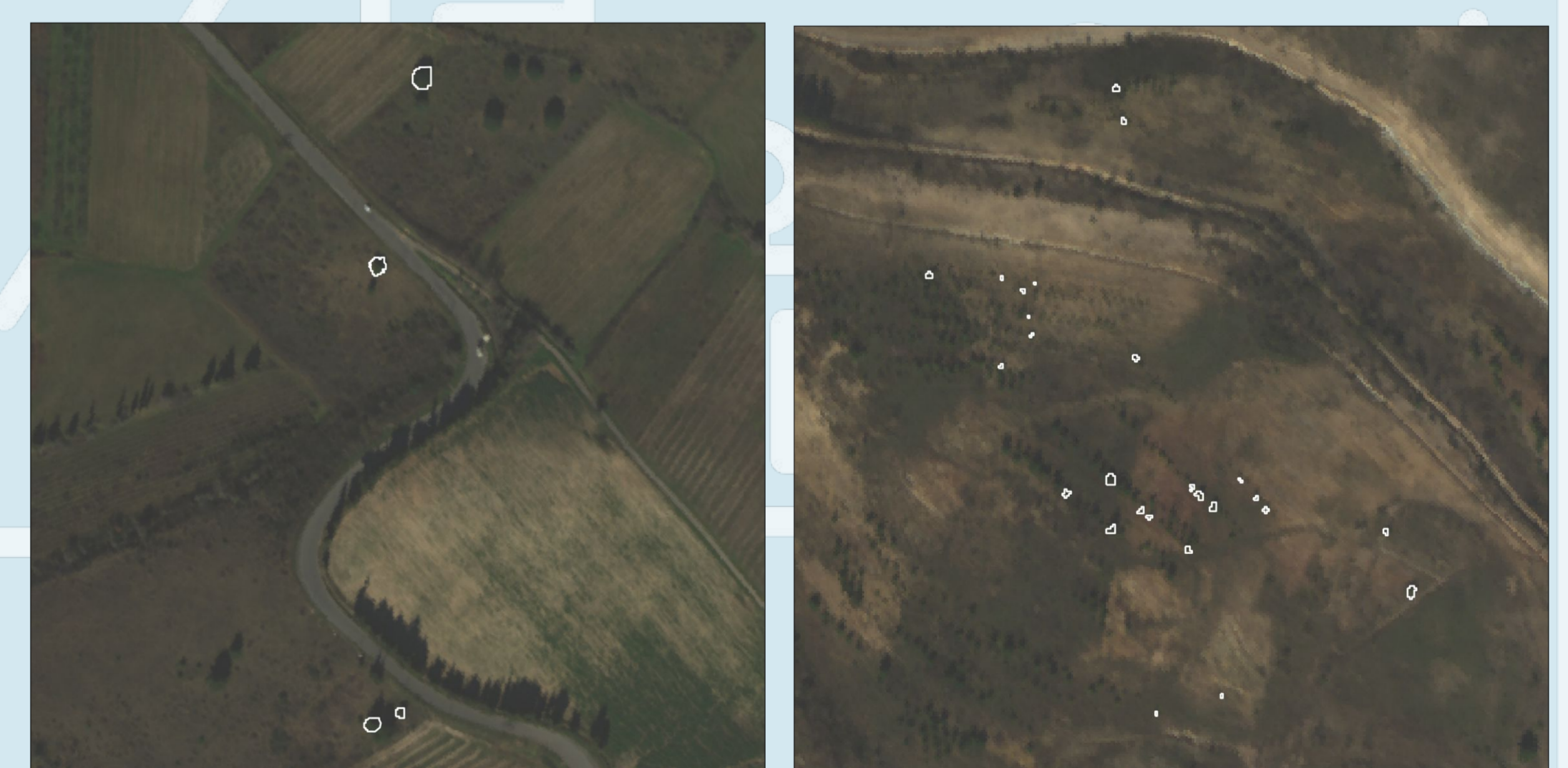
Figure 3. The test area visualised in RGB with the test tree segments highlighted in white.