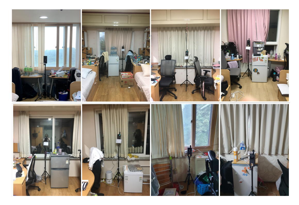
Fig. 1. Configurations of the dormitories with an ESM device installed in the middle

designed to encase the components and to emulate standard smart speakers. This assembled smart speaker was placed on the height-adjustable stand, as the speaker required additional height adjustment for an unobstructed view of the entire room from the camera lens. During data collection, the speaker was located at the center of the room near the inner wall with its height adjusted to eye level to accurately detect movements within the whole room.