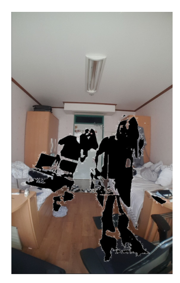
(a) Picture of a room