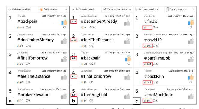
Figure 2: Trending examples of (a) Campus Now , (b) To day vs. Yesterday , and (c) Steady Stressor .

can navigate quickly through the topics because the information becomes concise and abstract. Third, sharing personal experiences with hashtags can strengthen anonymity as the abstraction and conciseness reduce the risk of identity revelation. Lastly, while abstract hashtags could obscure the details of individual experiences, abstraction increases the likelihood that a broader range of users would empathize with the topic. If desired, users can engage in further discussion through comments in the hashtag-based anonymous chat room, as shown in Figure 1 (b). Topic-based anonymous chat rooms could gather users with similar experiences to share coping strategies and leave encouraging comments, while general online bulletins are likely to disperse users' contribution to multiple redundant posts [3]. To compensate for the loss of context in hashtag-format sharing, StressTrendmeter lets users select relevant stress categories for their hashtag among 'personal', 'academic', 'health', 'relationship', 'financial', and 'miscellaneous', which are common stressors for college students [2, 5].