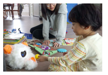
Figure 1: A boy interacting with I-Eng. When he present tagged objects to the talking doll and it reacts by speaking

The ideal scenario in language education is children learning new words and sentence-building skills on their own. This way of learning is naturally done in native language acquisition. However, natural acquisition of a second language is difficult, as children