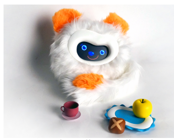
Figure 2: The talking doll and tangible object toys

The interaction can detect multiple objects at once and give different responses reflecting the object combinations, e.g. "A piece of bread! What a perfect match with my warm tea," when the cup and bread toys are placed in front of the doll, and "Let's make apple juice," when a cup and an apple are placed together. Due to technical limitations, only up to two objects can be detected by the talking doll prototype. The interaction state machine was designed to