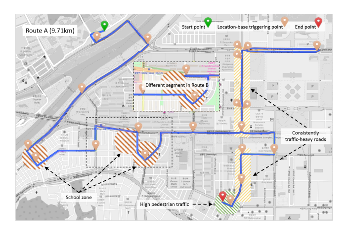
Figure 2: Route A in the round-trip driving course. Route B (returning route) is slightly different from Route A (see the dotted box for a different route).