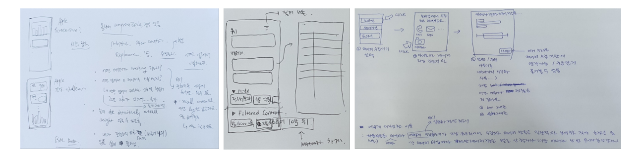
Figure 1: Drawings from focus group interview about visualization support. Participants suggested several visualization supports such as a bar graph (left), sensor data lists (middle), and icons with detailed explanations of each sensor data (right)

Table 2: Privacy sensitivity score toward mobile data collection (1: Highly Negative, 7: Highly Positive)