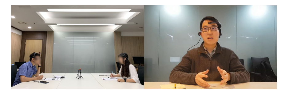
Fig. 1 Picture on the left shows a pair of participants sitting at a table preparing for a debate. Two smartphones on tripods in the middle of the table (highlighted in red) recorded participants' facial expressions and movements in their upper body, as shown on the right in the sample screenshot of footage.