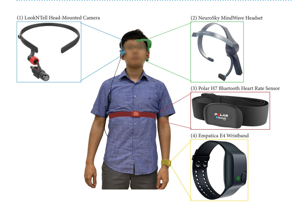
Fig. 2 Frontal view of a participant equipped with wearable sensors.

Fig. 1 Picture on the left shows a pair of participants sitting at a table preparing for a debate. Two smartphones on tripods in the middle of the table (highlighted in red) recorded participants' facial expressions and movements in their upper body, as shown on the right in the sample screenshot of footage.