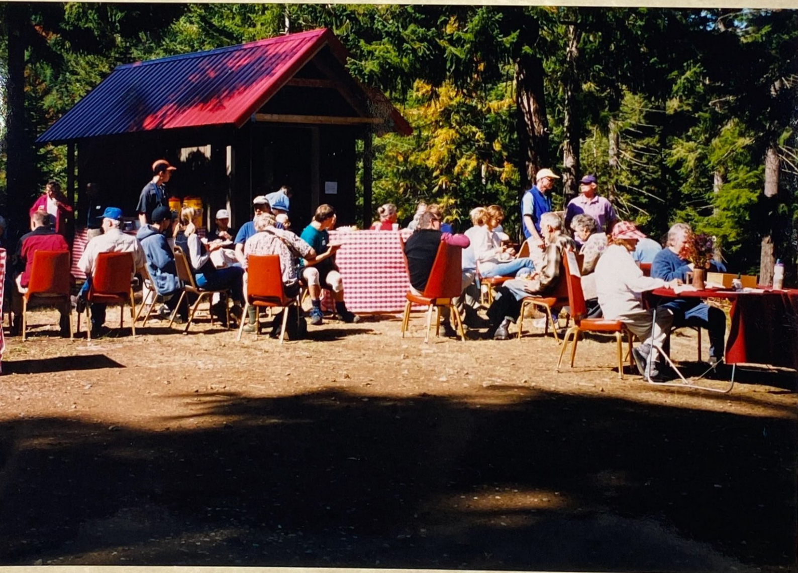
The crowd enjoying lunch on a glorious day at Meany