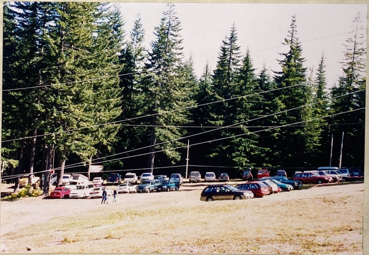
parking lot on the beginners slope by the "Snail Tow."