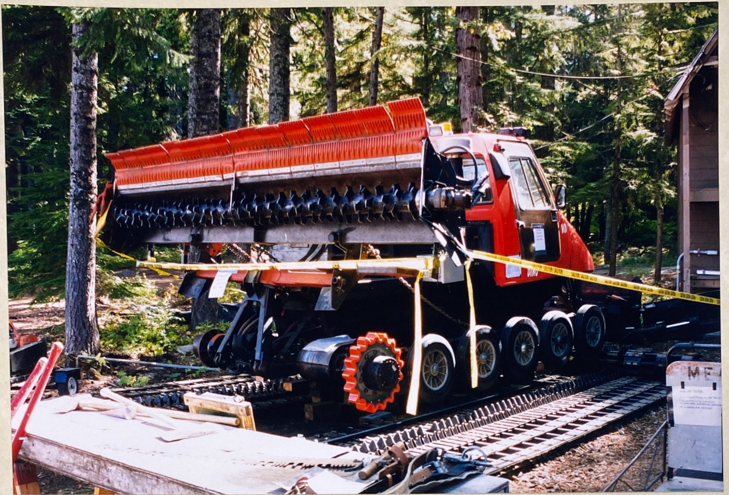
"Dino" (saw) with small tool display in foreground