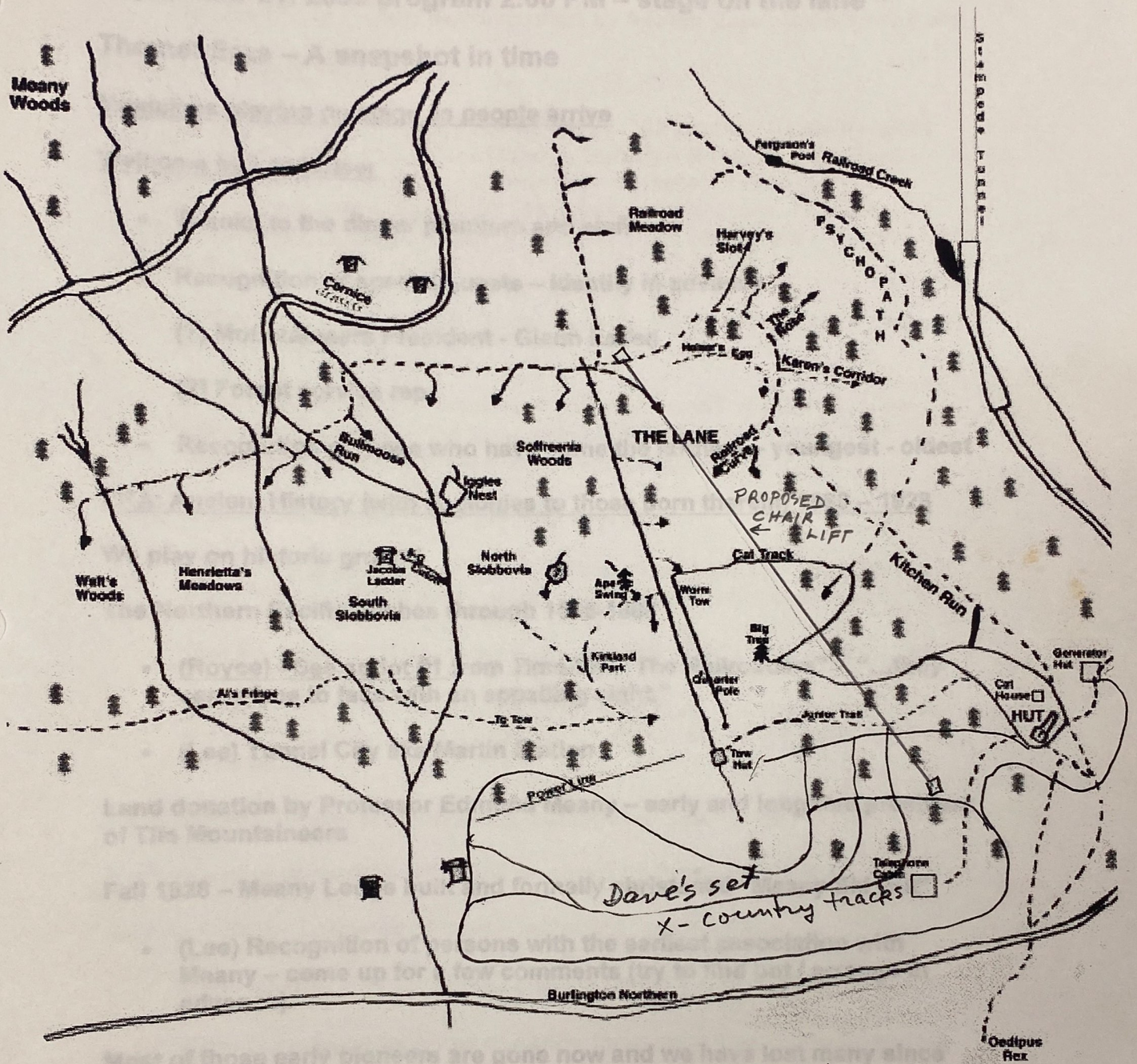
The Meany trail Map