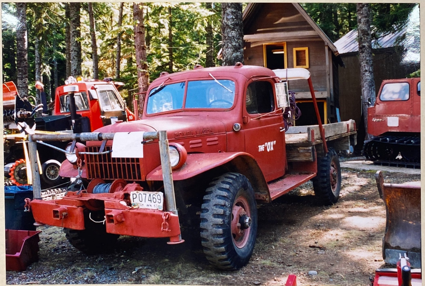
partial view of equipment displayed in "Petting Zoo"