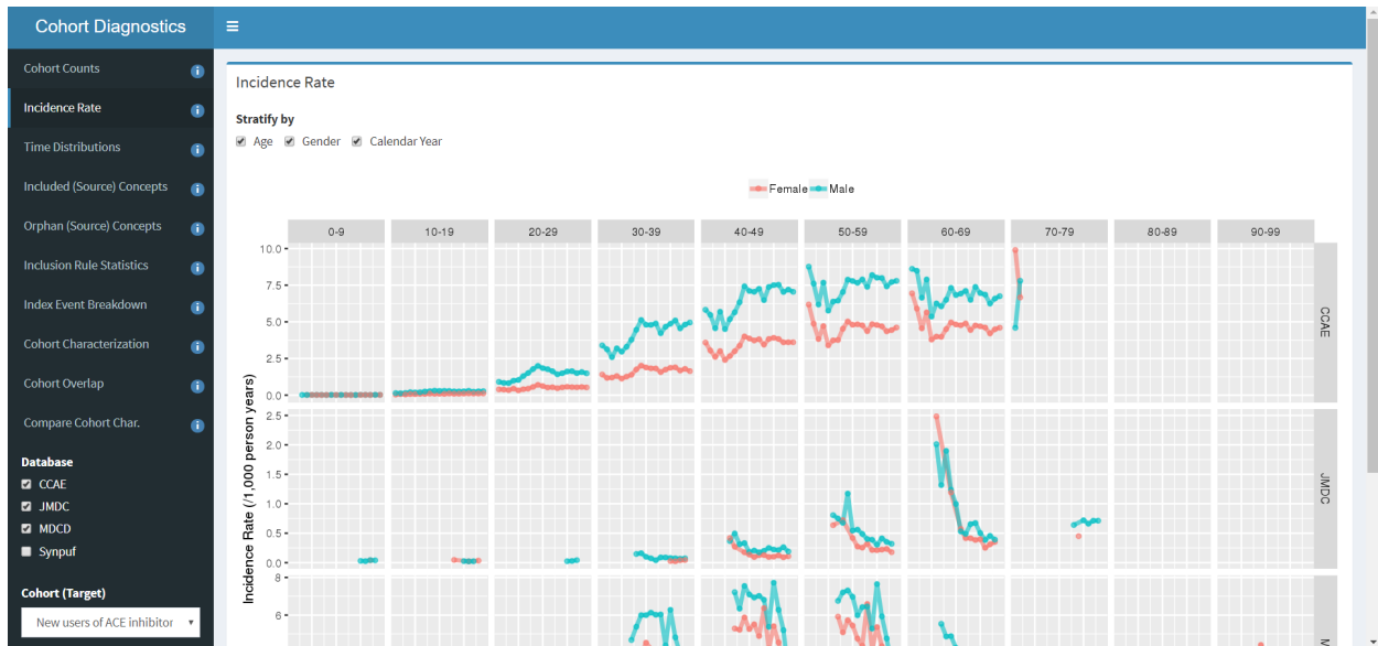
Figure 1: The Diagnostics Explorer Shiny app