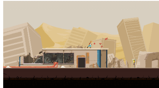
Figure 1: A screenshot of Kandria

Permission to make digital or hard copies of part or all of this work for personal or classroom use is granted without fee provided that copies are not made or distributed for profit or commercial advantage and that copies bear this notice and the full citation on the first page. Copyrights for third-party components of this work must be honored. For all other uses, contact the owner/author(s). ELS’23, Apr 24–25 2023, Amsterdam, Netherlands © 2023 Copyright held by the owner/author(s). ACM ISBN 978-x-xxxx-xxxx-x/YY/MM. https://doi.org/10.5281/zenodo.7816871