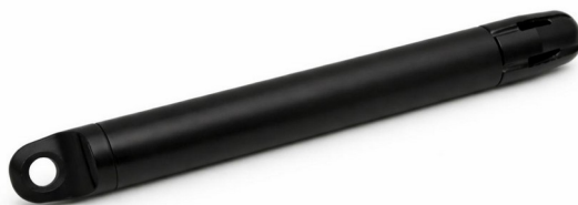
Figure 1: Aquatots nano — compact 1" submersible probe with integrated sensor, data logger and BLE radio.