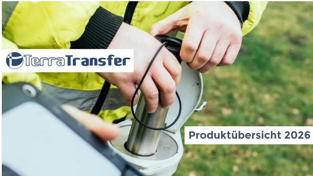
Figure 2: Installation of the Aquatots nano in a groundwater observation pipe — cable remains slack, probe is lowered slowly.

The Aquatots nano is suitable for installation in observation pipes with an inner diameter \geq 1\frac{1}{4} inch (32 mm). Recommended procedure: