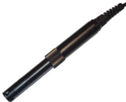
Figure 3: Typical SDI-12 water quality sensor for buoy deployment.

Water quality sensors are mounted at the desired measurement depth on the buoy body or on a sensor frame. All sensors communicate with the Aquatos Web LTX via the SDI-12 bus.