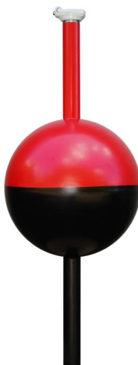
Figure 2: Standard measuring buoy (red-black) — robust platform for deeper waters.

Shallow water buoy (black): Compact, flat design for use in shallow water bodies from approx. 20 cm depth. Suitable for ponds, wetlands, flood plains, oxbow lakes and calm river sections. The low float body offers little wind surface area and is well-suited to exposed, low-wind shallow water.