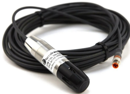
Figure 5: Piezoresistive pressure sensor Type 0312 — mounted on the anchor chain at a defined depth.

A piezoresistive pressure sensor can be attached to the anchor chain at a defined depth. This method measures the water level independently of the buoy's floating behaviour and is particularly more precise during strong water level fluctuations than a near-surface measurement.