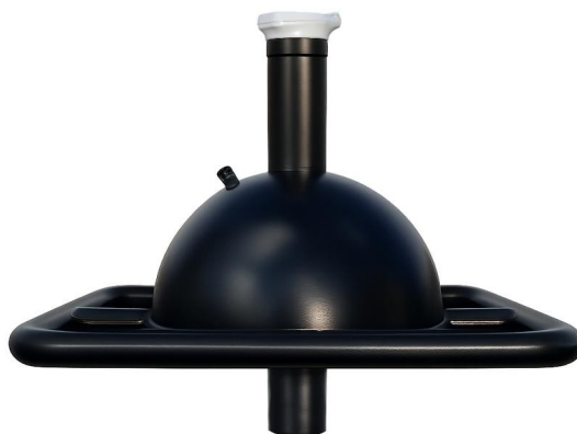
Figure 1: Shallow water buoy (black) — compact design for shallow waters from 20 cm depth.