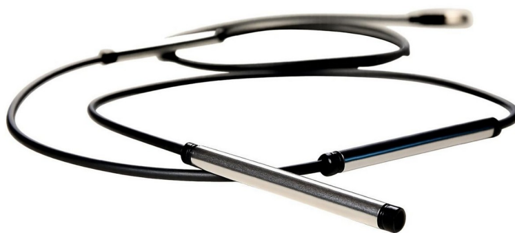
Figure 4: Temperature measurement chain with multiple thermistor nodes for depth profile measurement.