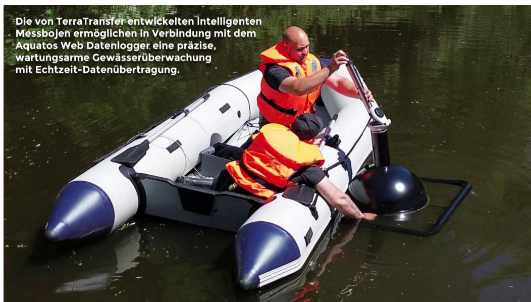
Figure 6: Deployment of the shallow water buoy from an inflatable boat — life jackets are mandatory.

For ponds, small lakes or shallow water areas, an inflatable boat is sufficient. Procedure: