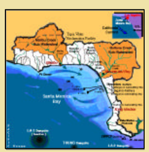
Figure 1: Study area along with the local watersheds

There are two study areas: The first is from Pt. Dume to Topanga Canyon, and the second is from Flat Rock Pt. To Pt. Fermin on the Palos Verdes Peninsula. Both study areas total approximately thirty miles of coastline (Figure 1).