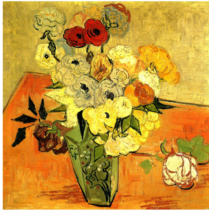
(b) Colour Reference