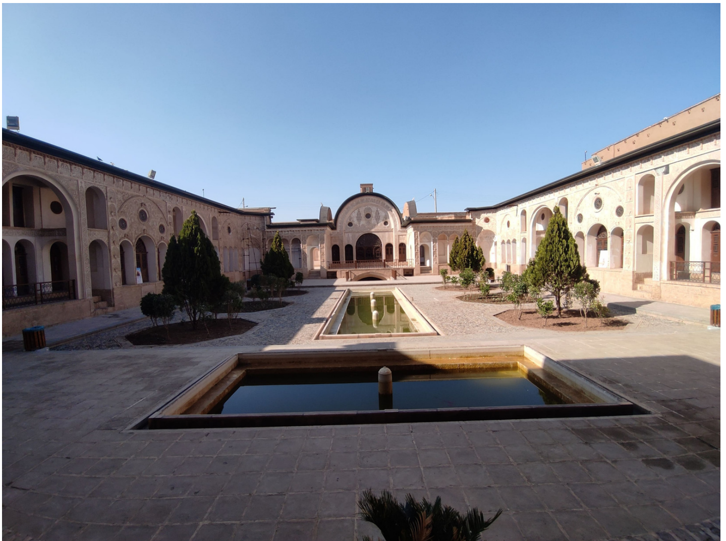
Tabatabaei House, Kashan

Next headed for lunch at Mozaffari Traditional Restaurant, had some Fesenjan. Next went to see the beautiful Tabatabaei Historical House, Borujerdi House and Sultan Amir Ahmad Bathhouse.