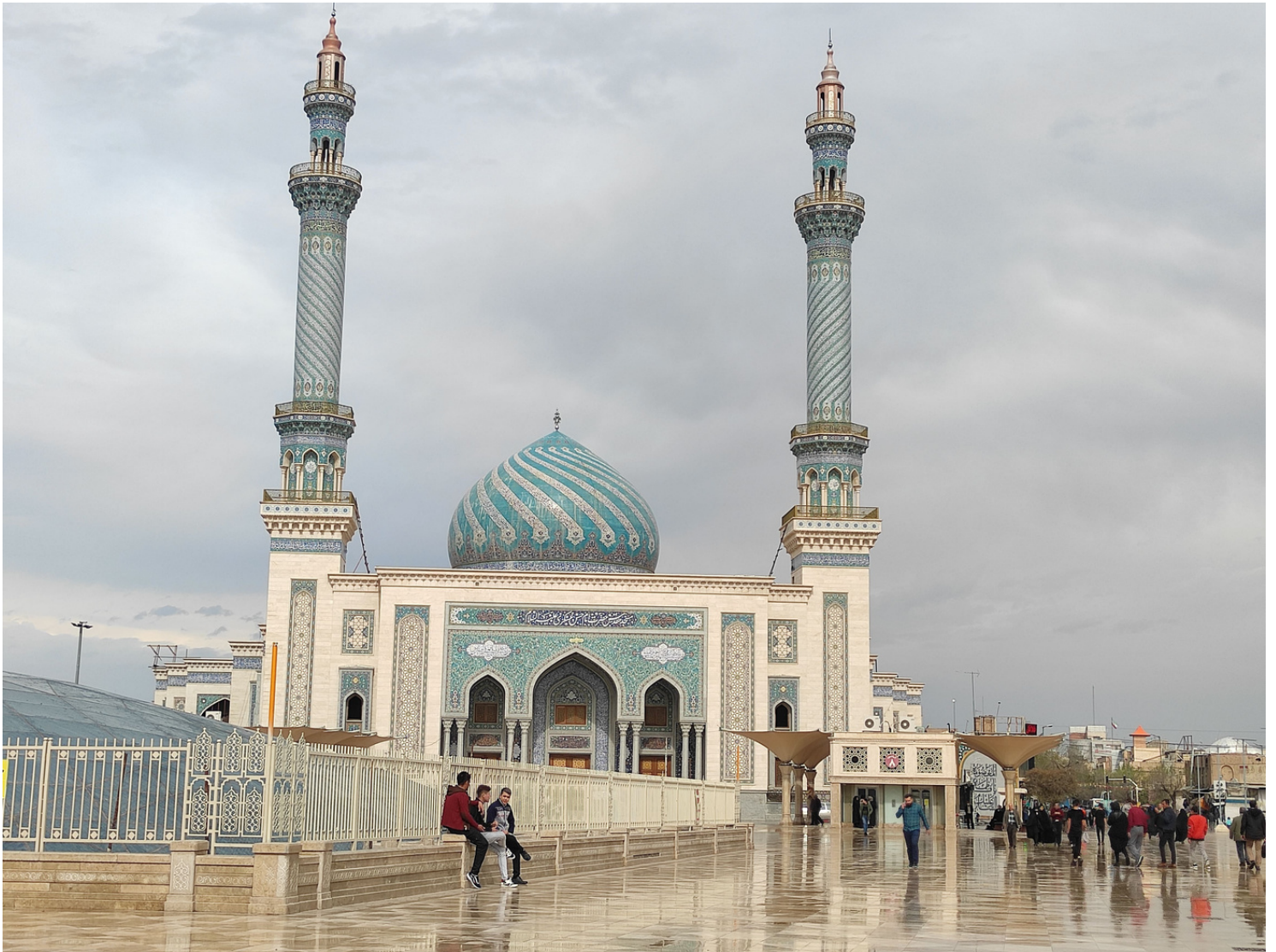
Imam Hasan al-Askari Mosque, Qom

I actually had the plan to go to Sari by train, but the train got cancelled. So I decided to go to Qom. Took the bus from Junoob terminal, after 2 hours journey from Tehran I was in Qom. Spent some time in Qom and then took a bus to Tehran.