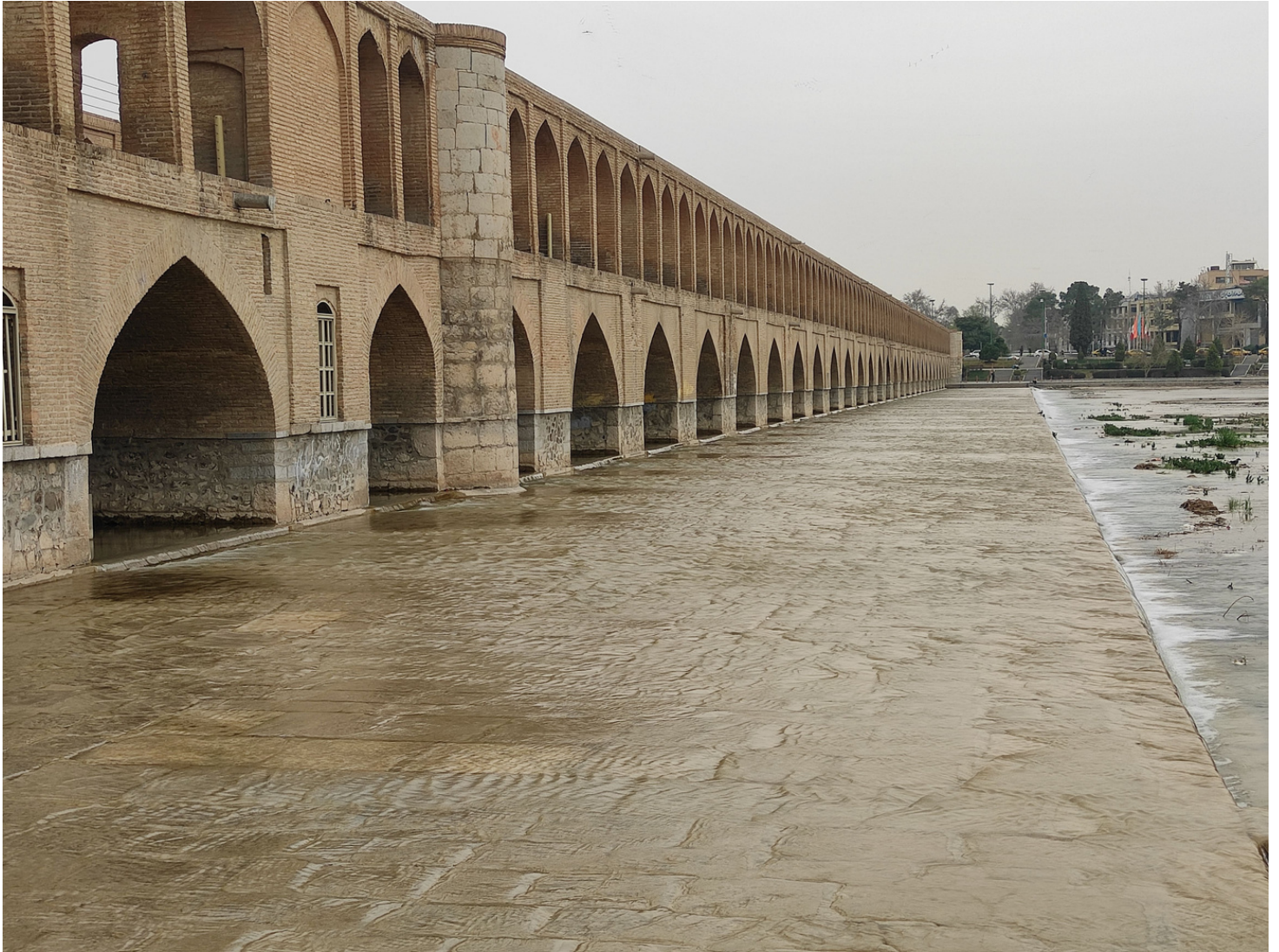
Si-o-Se Pol, Isfahan