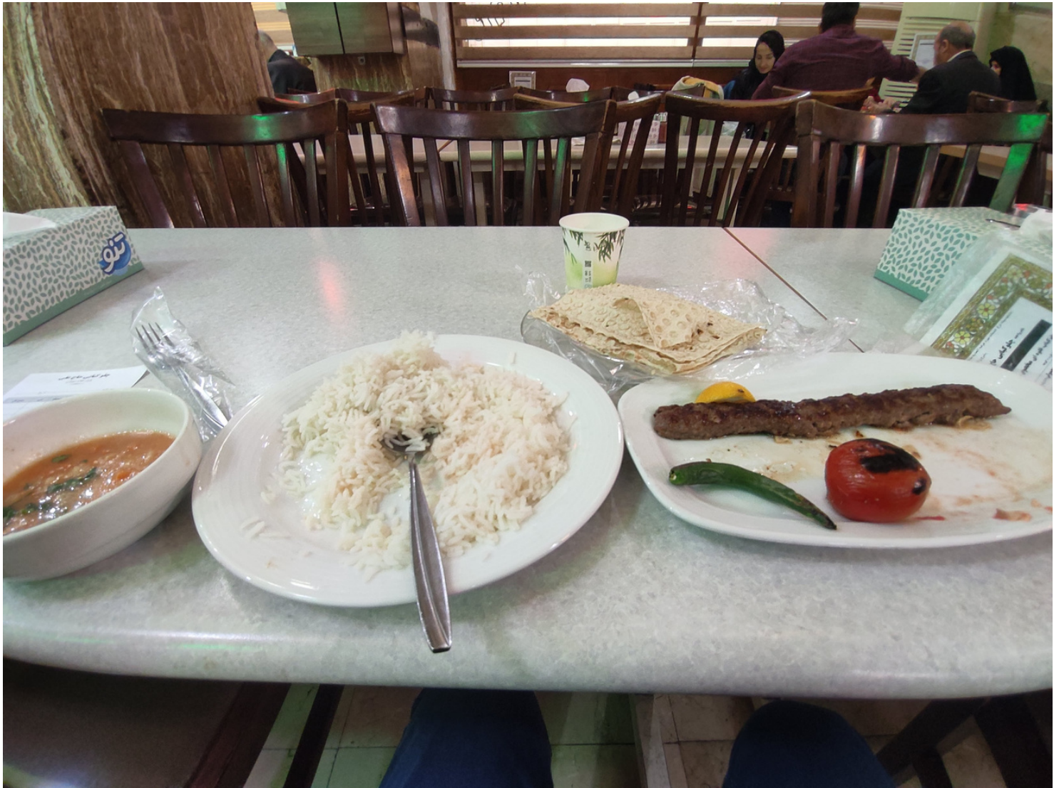
Lunch at Haj Ali Chelokababi, Tabriz

Next morning, walked around the streets of Tabriz, people were lining up at shop to buy the fresh bread, a very common scene across Iran. I had to catch a train to Tehran in the evening, so I still had some time to see little bit more of Tabriz. I was very hungry, went to Haj Ali Chelokababi in Tabriz Bazaar for lunch, it's said to be very good and indeed it was very good.