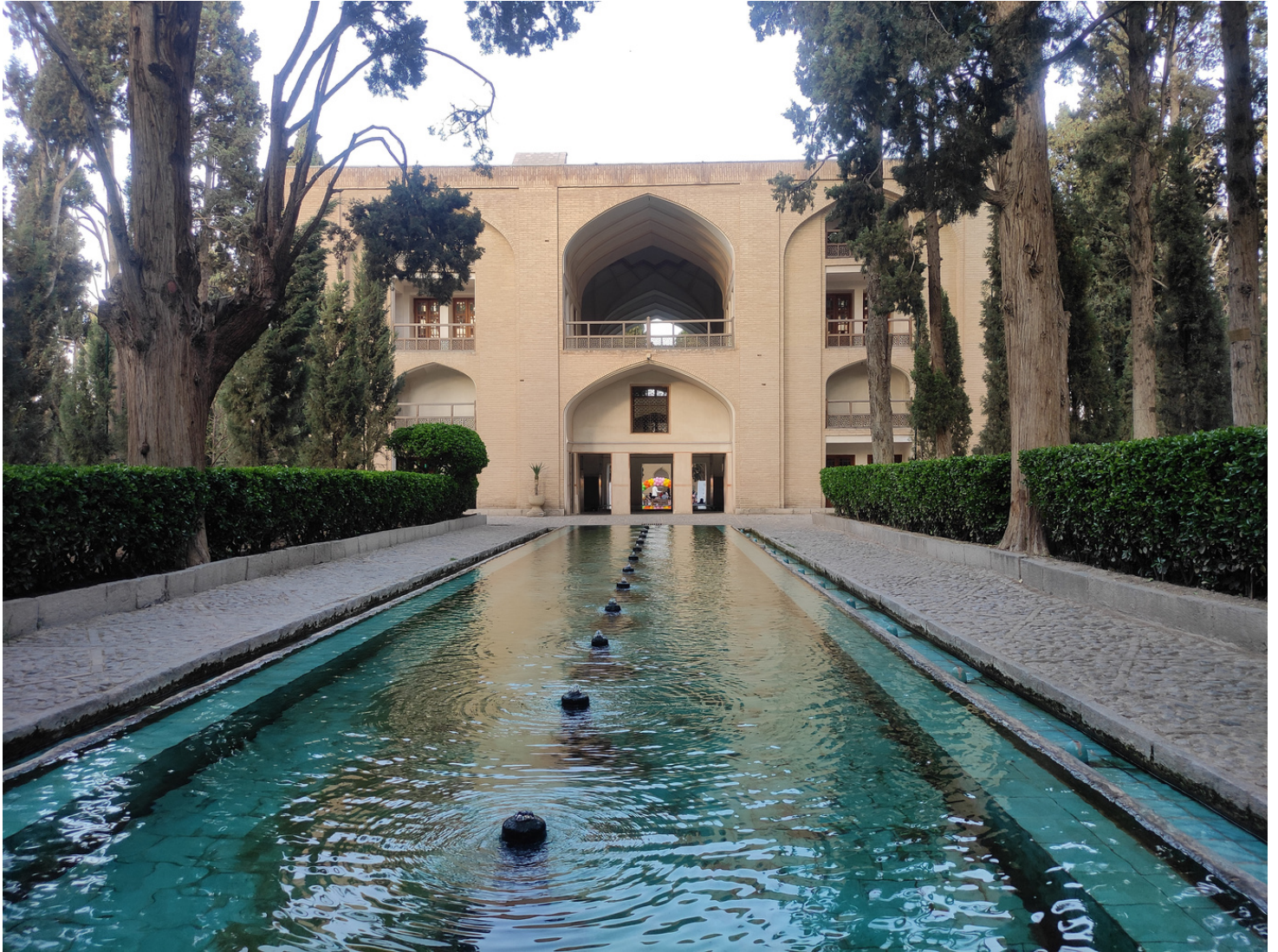
Fin Garden, Kashan