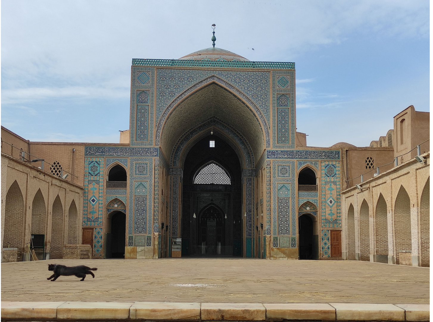
Jameh Mosque, Yazd