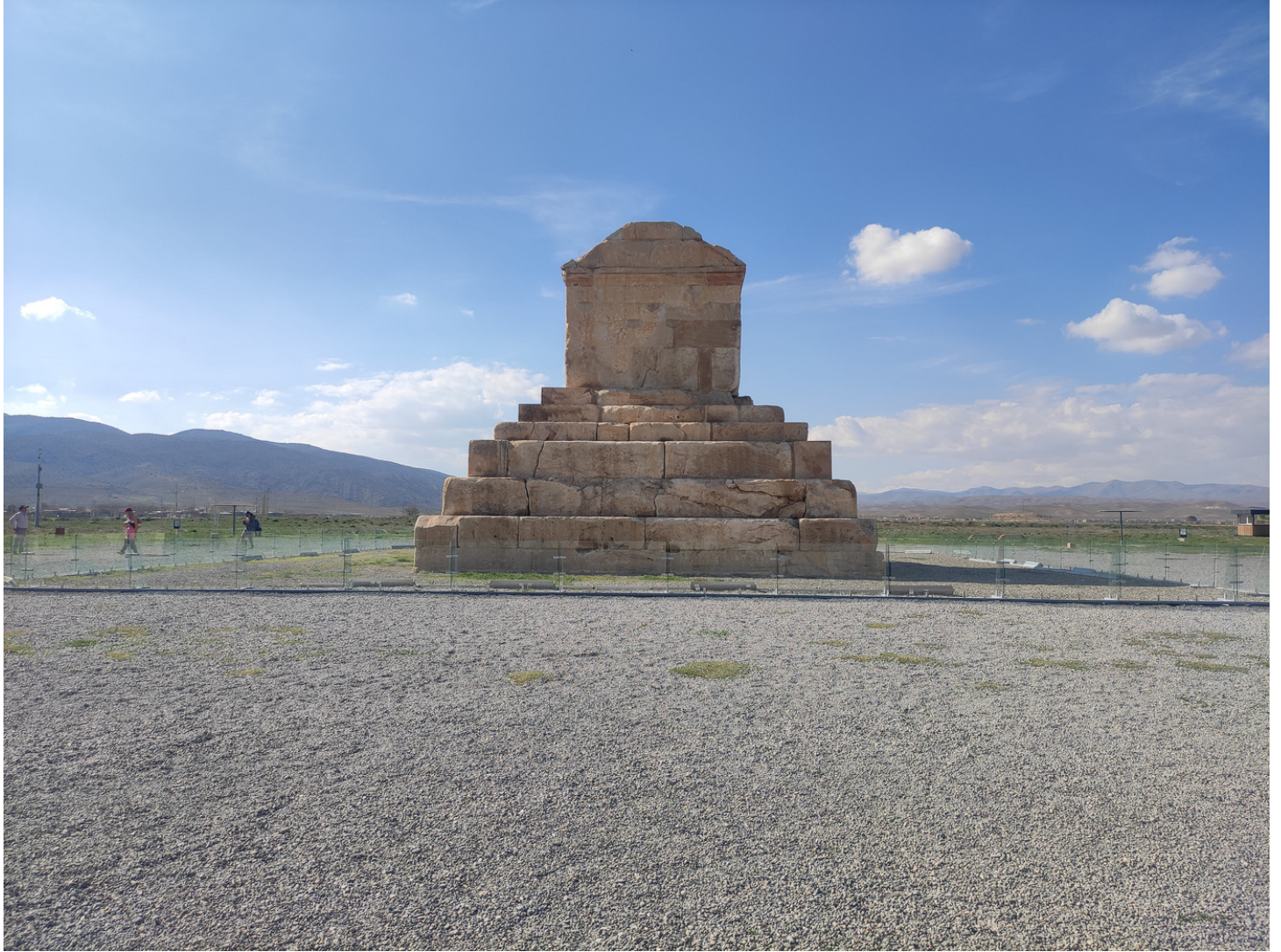
Tomb of Cyrus, Pasargadae

Visited the Persepolis, such old ruins, definitely it would have been a very big city in the past.