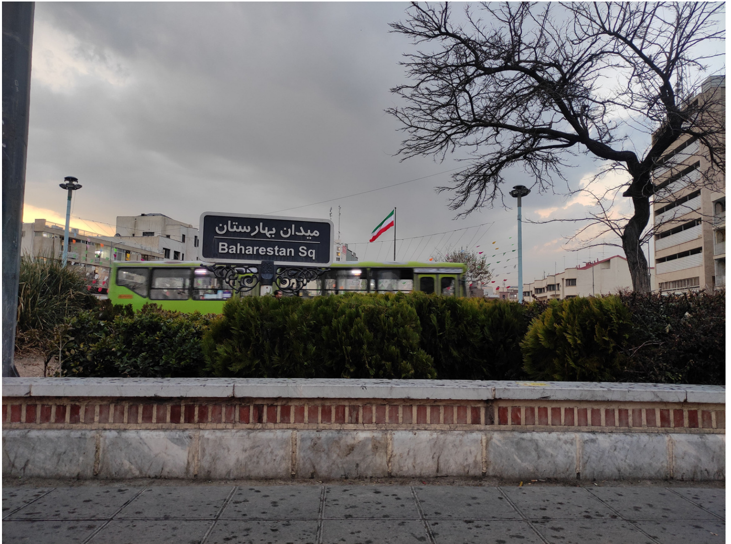
Baharestan Square, Tehran

Changed Indian currency to USD and Euro at Delhi airport. I was not very sure how much cash to take, but its always good to have some extra cash. Air Arabia flight was scheduled in early morning, reached Sharjah in morning, the connecting flight to Tehran was in afternoon. Reached Imam Khomeini International Airport (IKA), Tehran around 2 PM.