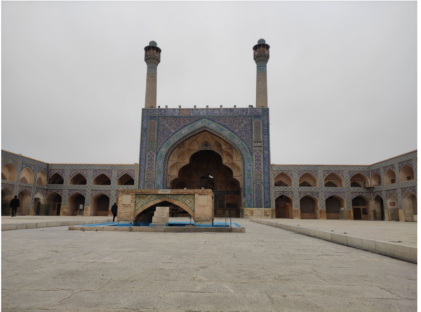
Jameh Mosque, Isfahan