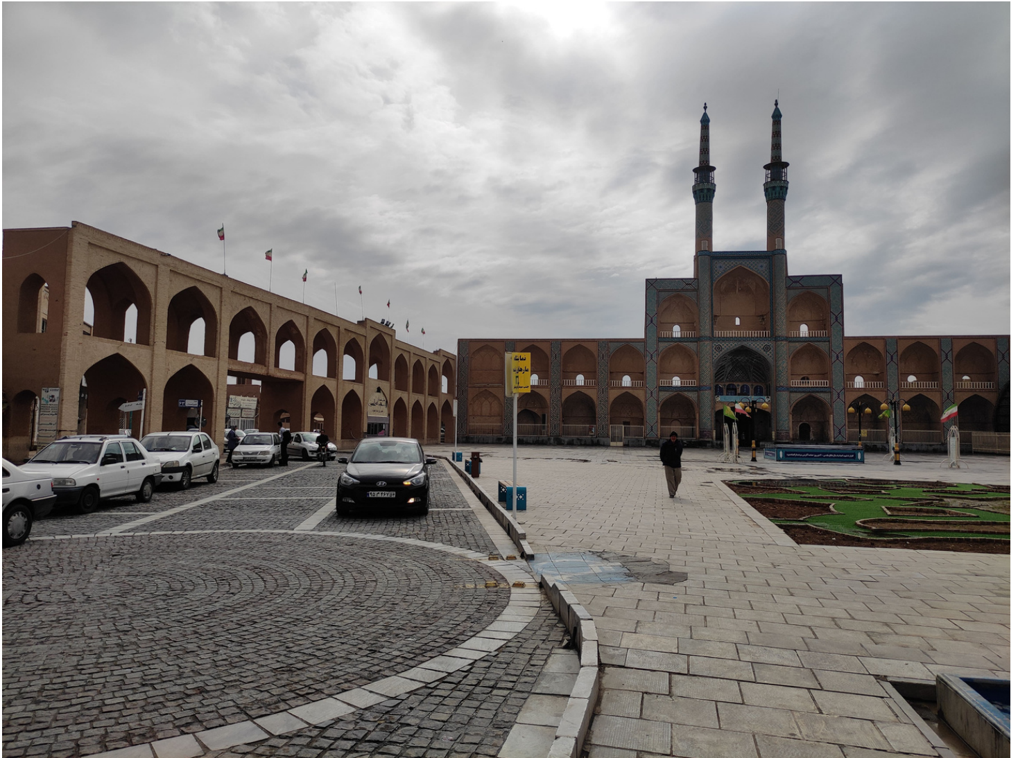
Amir Chakhmaq Square, Yazd

Next I went to see the beautiful Dowlat Abad Garden.