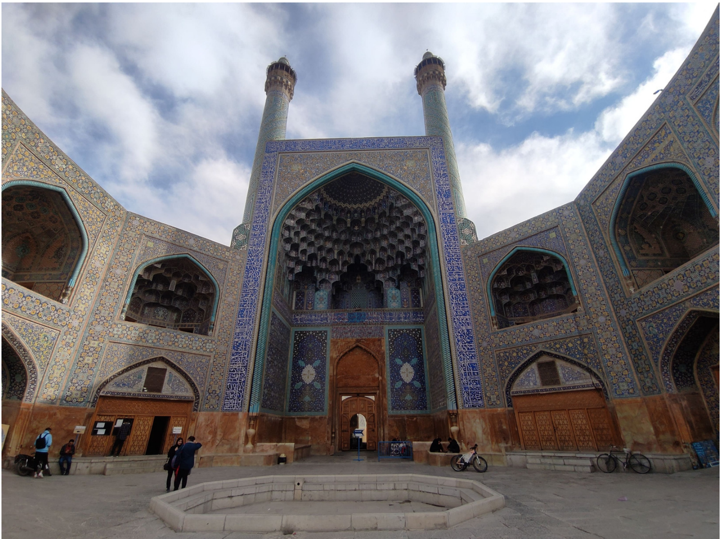
Shah Mosque, Naqsh-e-Jahan Square

Next I went to see the grand Naqsh-e-Jahan square, sipped ginger tea at the very colorful Azadegan Tea House in the bazaar.