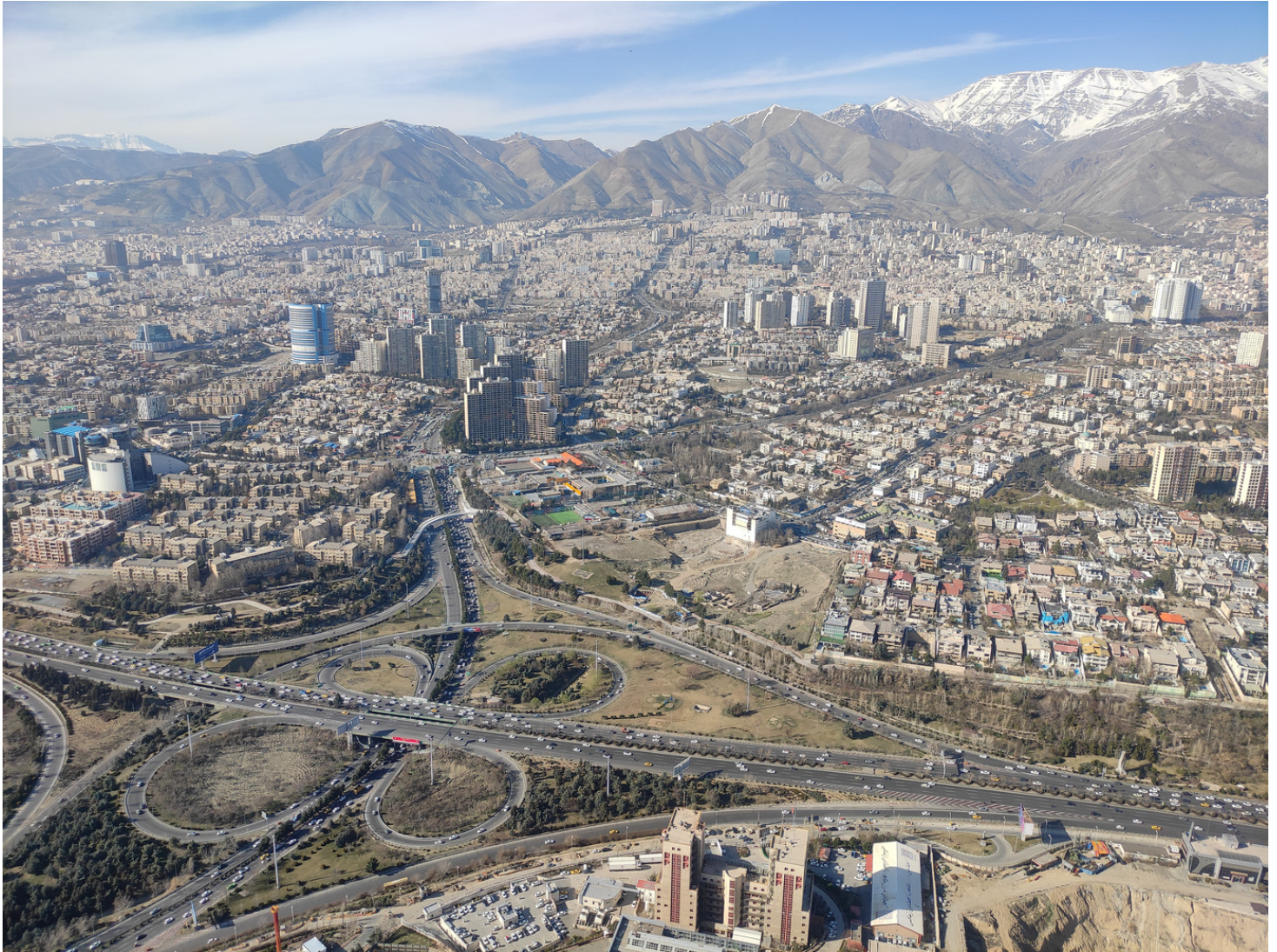
Tehran City from Milad Tower

Next morning walked to Tehran grand bazaar from the hostel in Baharestan. It's a big bazaar with shops selling different things in different alley.