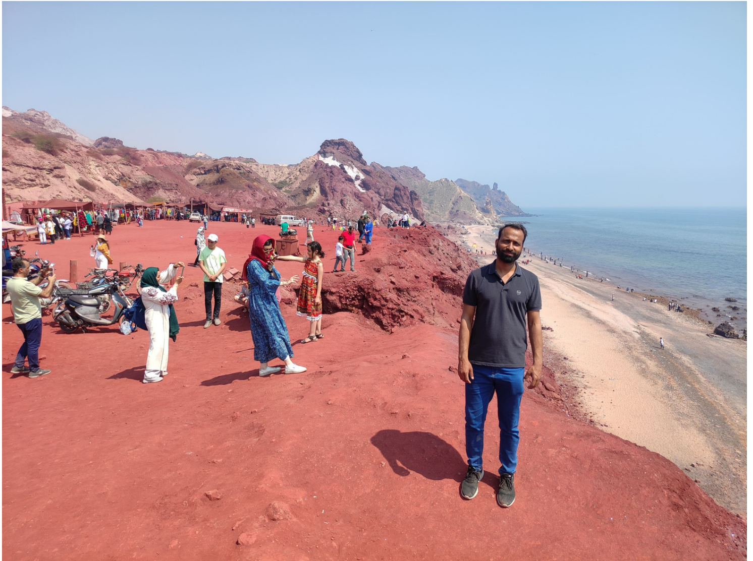
Red Beach, Hormuz Island

Next took the ferry from Hormuz to Bandar Abbas, had much needed lunch and carrot juice in Bandar Abbas. In night walked around the streets of Bandar Abbas and purchased a few things.