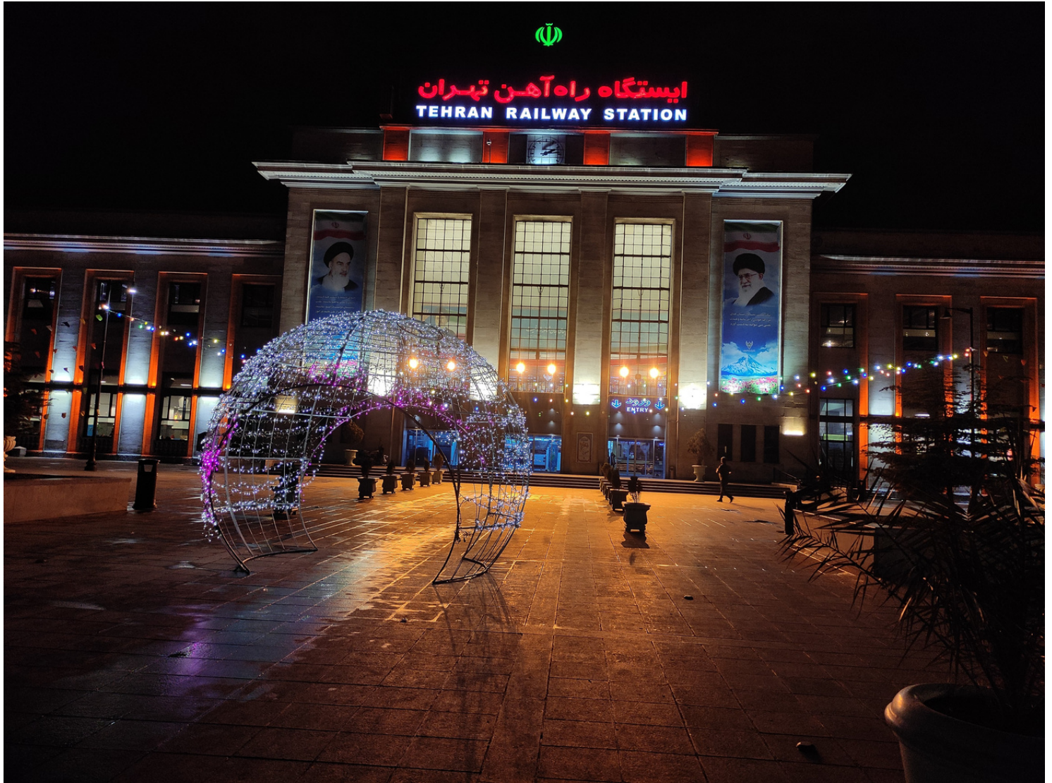
Tehran Railway Station

Next day early morning went to Tehran railway station to catch the train to Rasht which is capital of Gilan province. Got my Tourist Card from Pasargad bank, now I didn't need to carry large amount of cash. Also got Snapp taxi app installed on my phone.