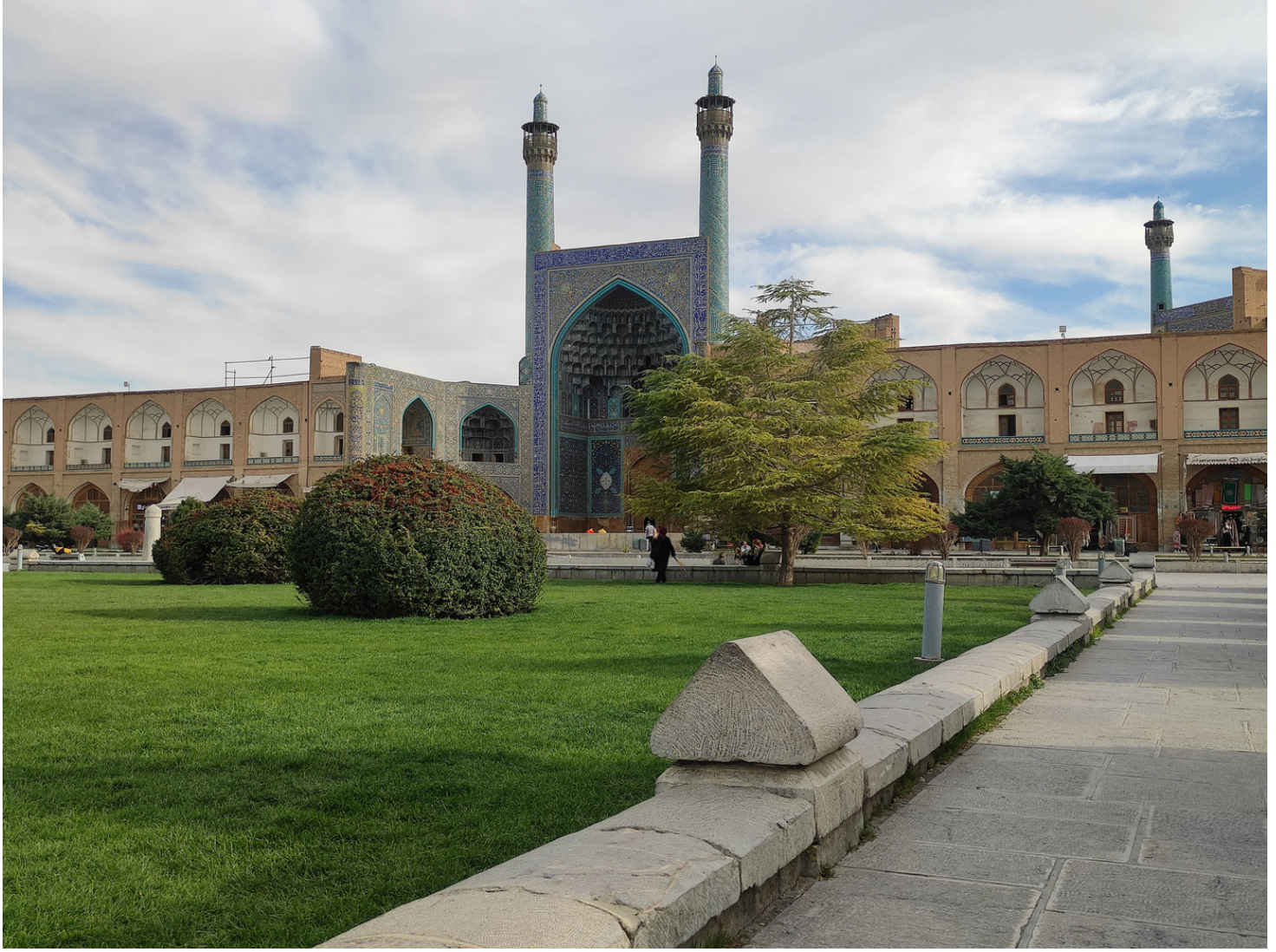
Naqsh-e-Jahan Square, Isfahan

Next morning went straight to the Kashan bus station to catch a bus to Isfahan. Waited for bus about an hour, after few hours of journey, reached Kaveh Bus terminal in Isfahan around afternoon. Booked a Snapp to reach Isfahan Heritage hostel.