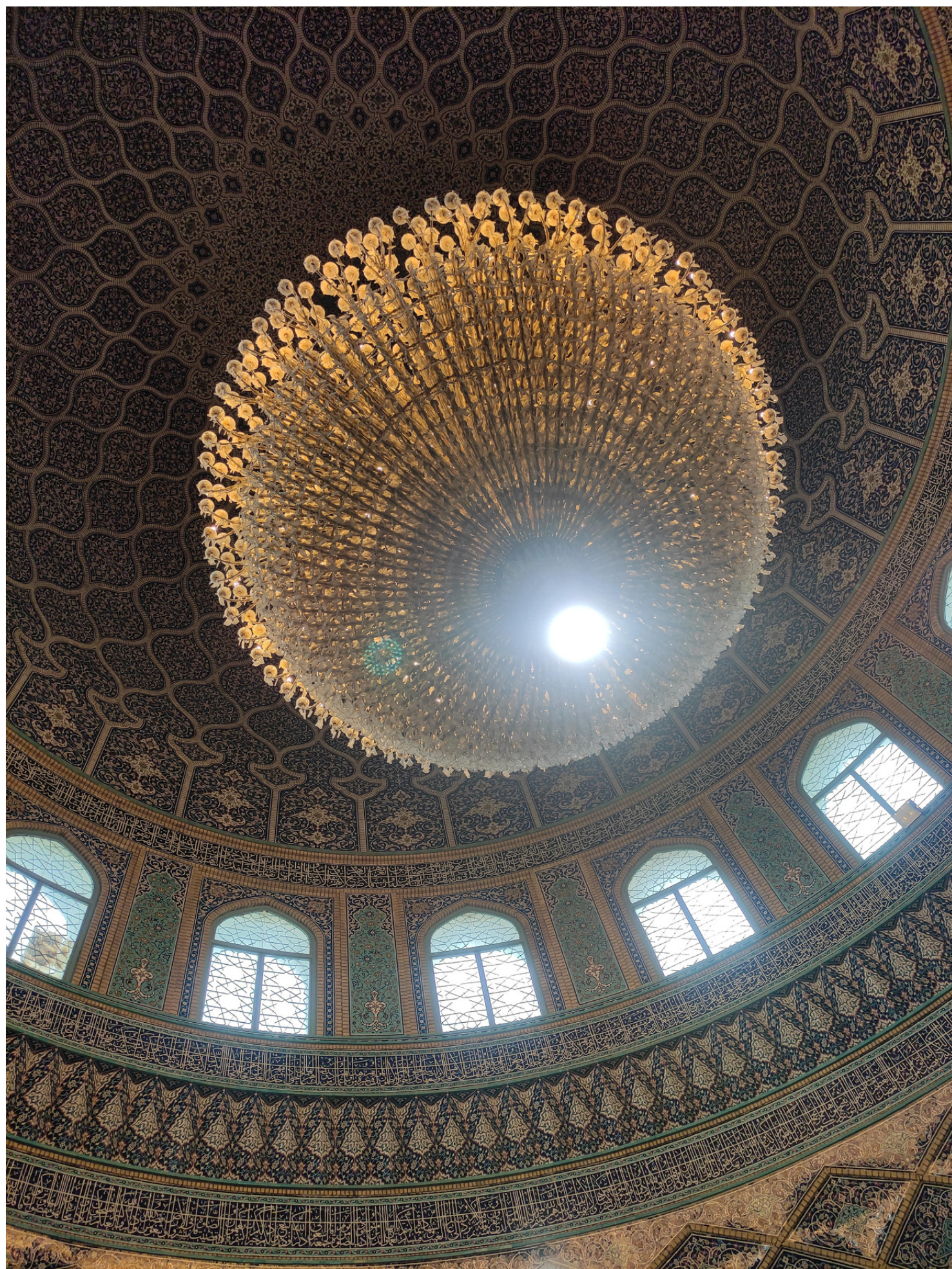
Beautiful Chandelier in the Mosque, Qom