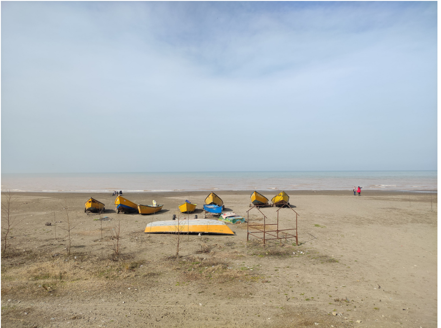
Chalus Beach on Caspian Sea, Mazandaran

The bus dropped me in Chalus on the main road, I had to go to Chalus beach. But I didn't know how to get there, one young man who was selling some vegetables around the road helped me get a Snapp taxi which dropped me to Chalus beach. The young man told me that he is turkish and belongs to Ardabil.