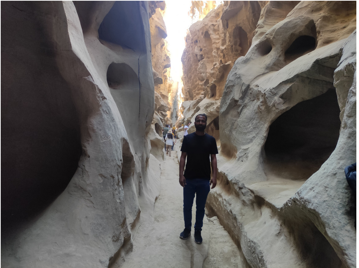
Chahkooch Canyon, Qeshm Island

First visited the Chahkooch Canyon, and got a glimpse of Hara forest (the Mangrove forest on Qeshm Island).