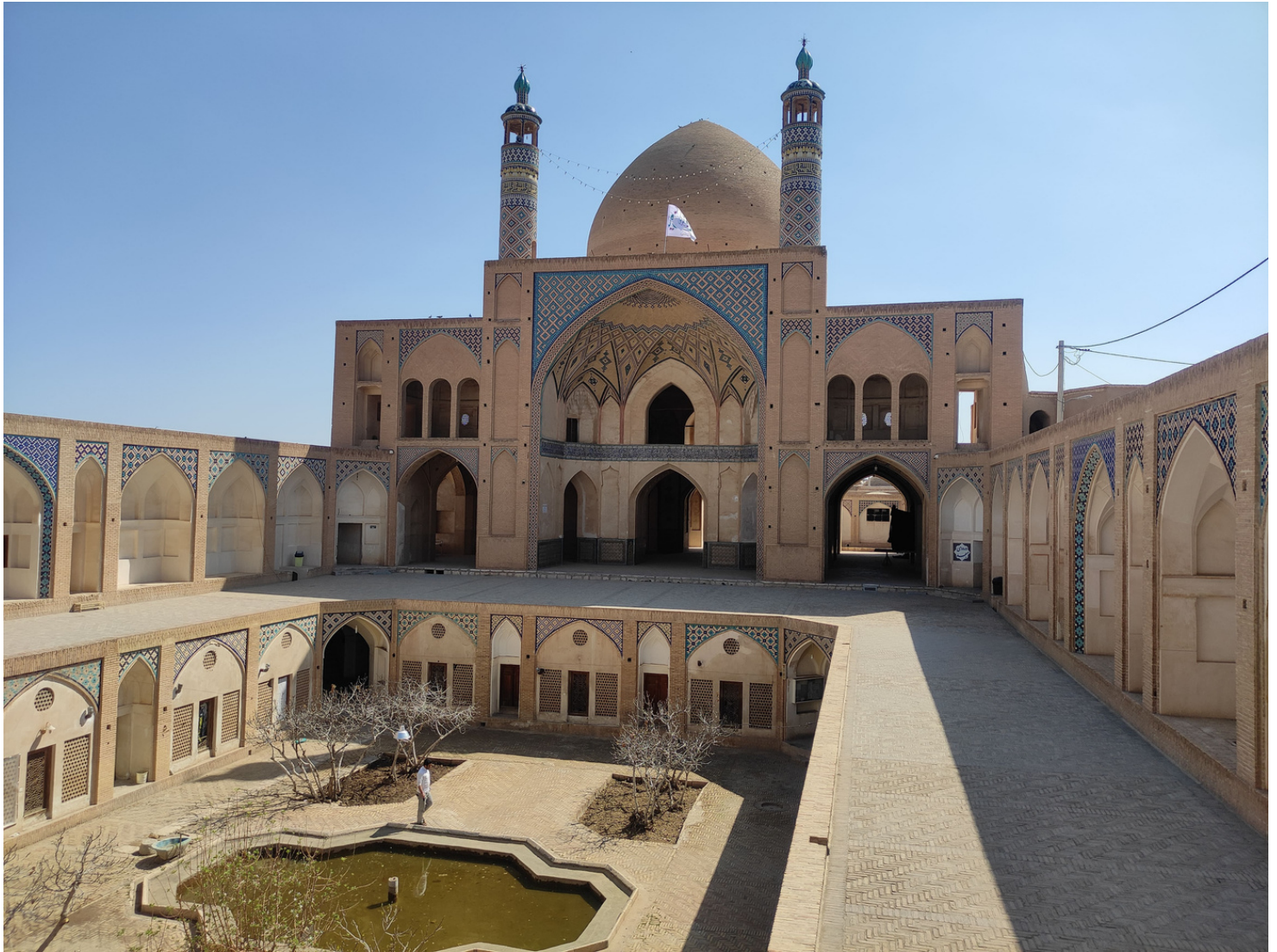
Agha Bozorg Mosque, Kashan

Early morning reached Tehran railway station, booked a Snapp taxi to reach Heritage hostel in Tehran to collect one of my luggage which I stored in the luggage room in the hostel. Said Salam to folks at the hostel and headed to Junoob bus terminal. Got into the bus to Kashan, reached Kashan in few hours.