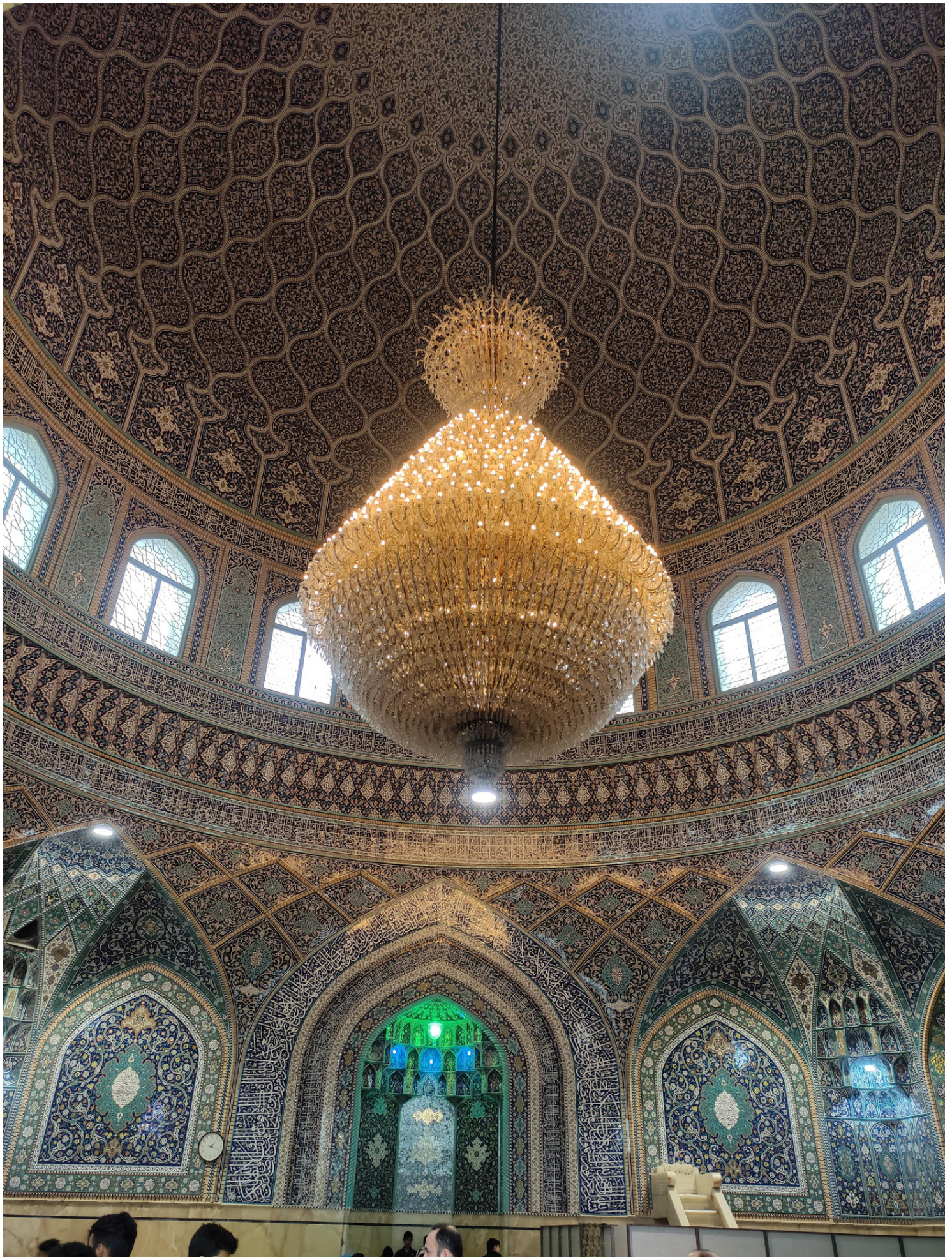
Beautiful Symmetry in the Mosque, Qom