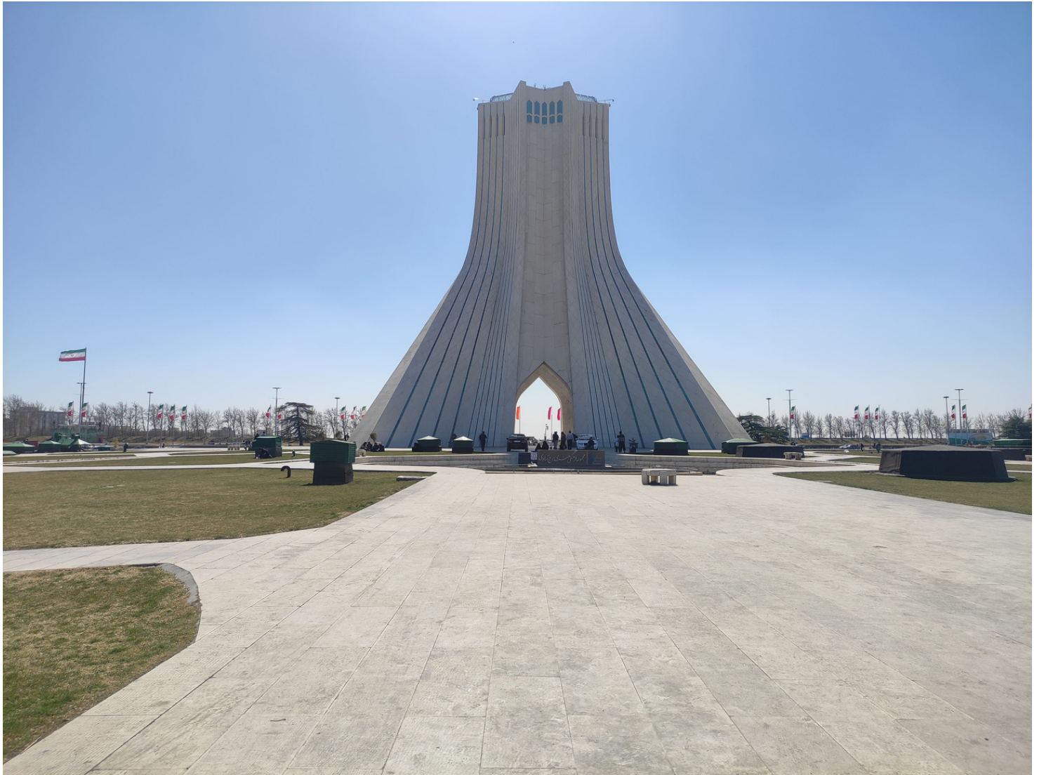
Azadi Tower, Tehran

Next I took the metro again to reach Milad Tower. Took the ticket to go to the open observatory, 15 USD for foreigners. Beautiful views of Tehran city also the wind was very powerful at the top.