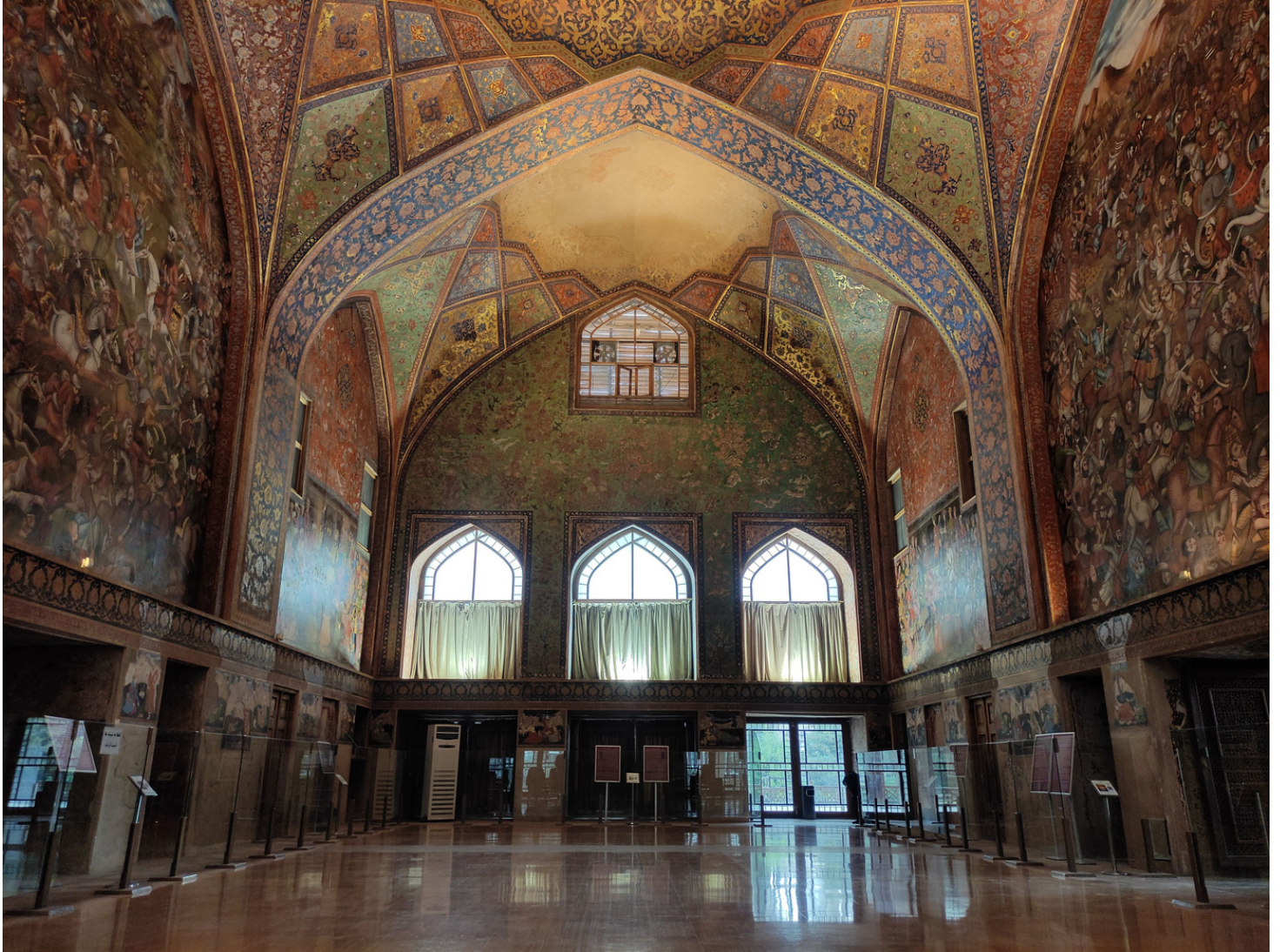
Chehel Sotoon, Isfahan

I still had some time in Isfahan, so went to see Chehel Sotoon, Si-o-Se Pol, Jameh Mosque of Isfahan & Imam Ali Square.