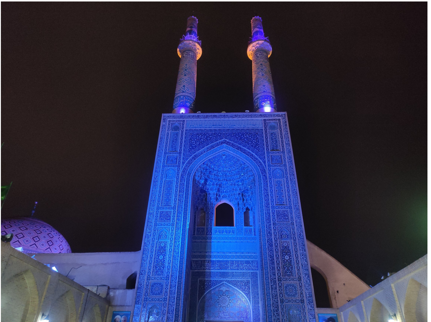
Jameh Mosque of Yazd at Night

Next headed to Kaveh bus terminal in Isfahan to catch the bus to Yazd. Reached Yazd bus station in night, it was raining in Yazd. Checked in Yazd Friendly Hotel, the tea was ready and the hotel owner insisted me many times to have it. Then went outside and had Shooli Soup.