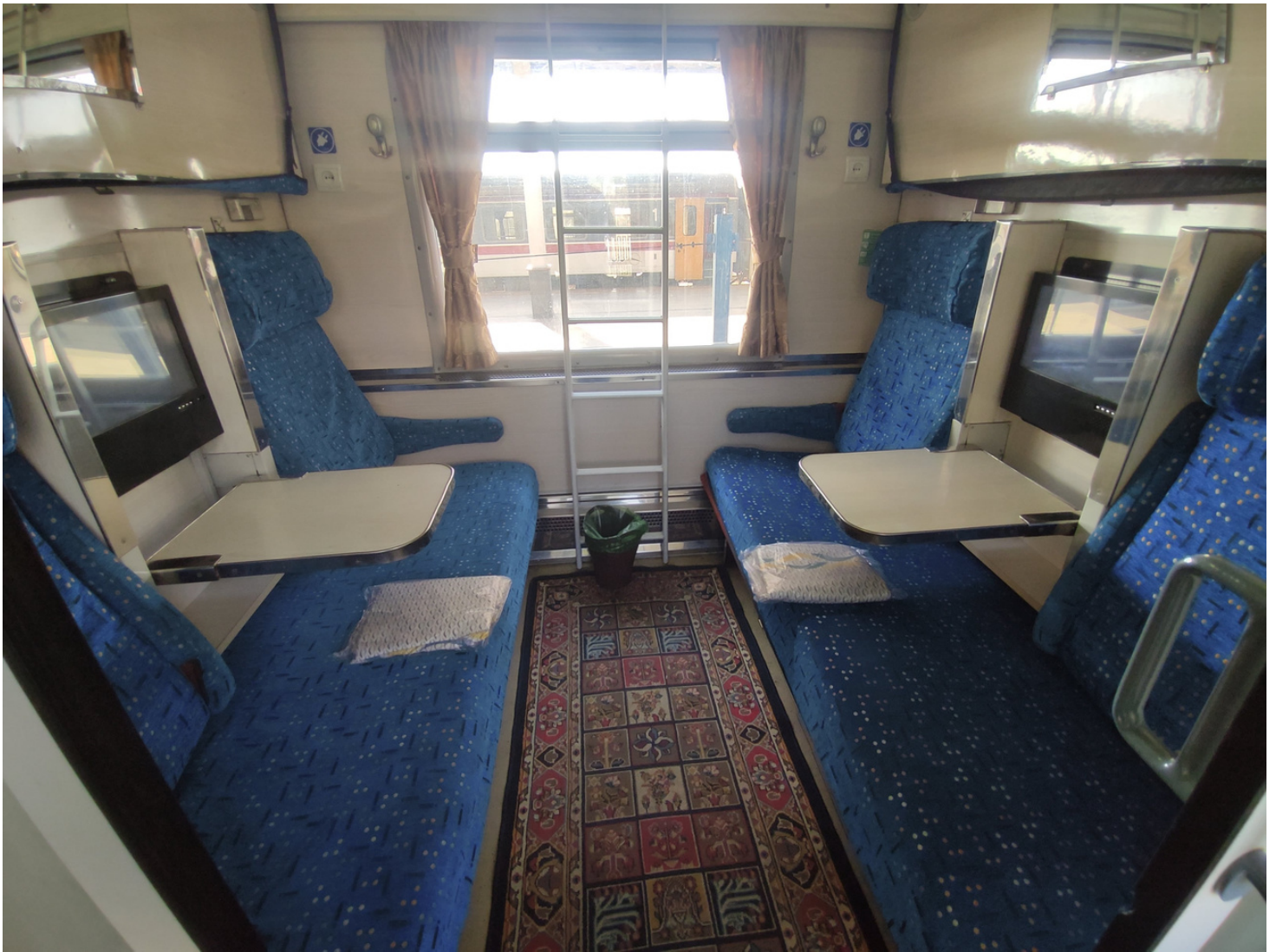
Raja Train Tabriz to Tehran

After some more walking around the city and seeing Saat square, it was time to make a move to Tabriz railway station. Boarded the train to Tehran, after few stations 3 more people joined me in the compartment. Had some tea, some conversation and then went to sleep.