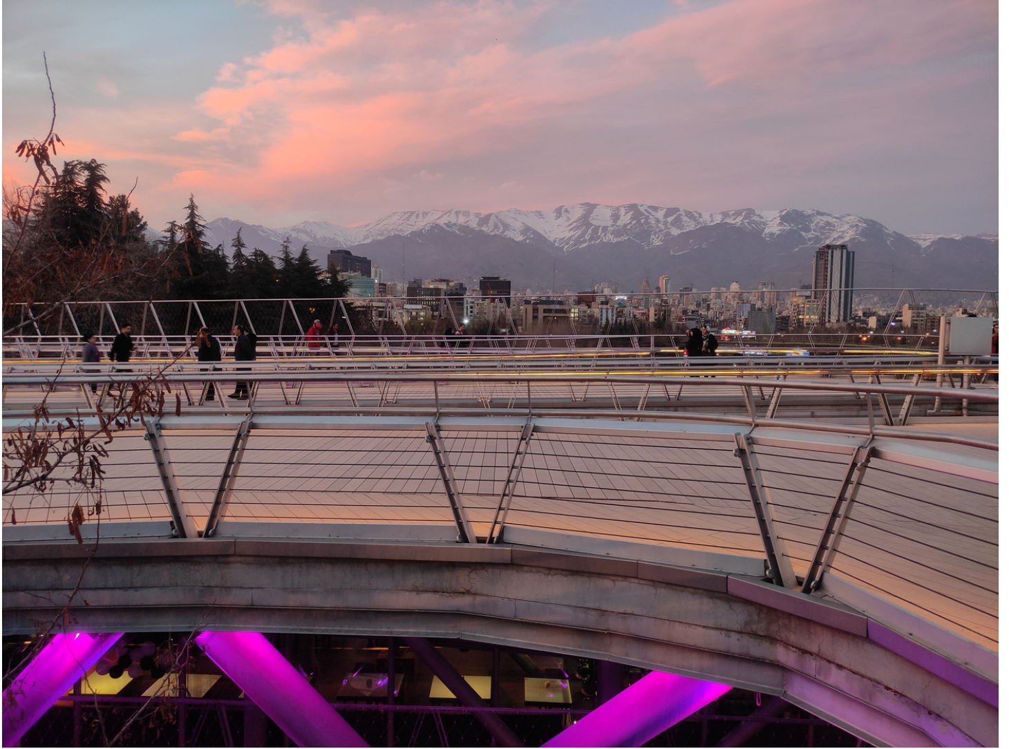
Tabiat Bridge, Tehran