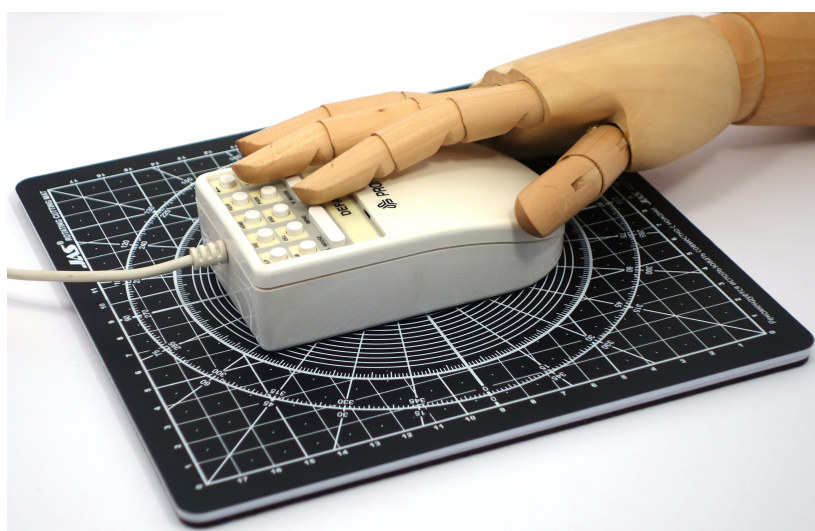
Figure 3: Prohance Mouse with a human hand model

As [2] notes, the earlier version of the driver contained errors that caused the mouse to work inadequately in Microsoft Word (even its slight movement led to page scrolling), which were fixed in the updated version. There was also some software incompatibility with the Microsoft mouse driver, which resulted in the mouse not working with some applications.