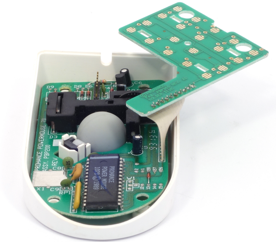
Figure 4: Prohance mouse disassembled