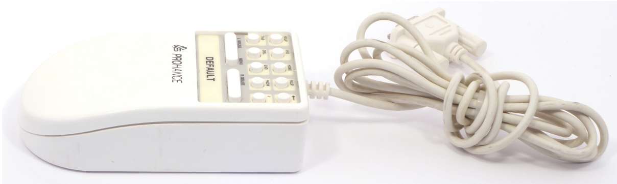
Figure 1: Prohance PowerMouse

The Prohance Mouse was released by Prohance Technologies inc. in 1989 as part of a family of several mice and one trackball designed for use with Lotus 1-2-3 spreadsheets (and some other similar applications). The concept of Prohance is to place a lot of additional buttons on the body, which, according to the developers, save the user from frequently moving his hand from the mouse to the keyboard and vice versa. The Prohance mouse contains an additional functional keyboard on the front part of the case. This model, named PowerMouse 50 on its box, has 10 function buttons (figure 1), and in general their number could reach up to 40 (which was implemented due to a very elongated mouse body, similar to a TV remote control) [1].