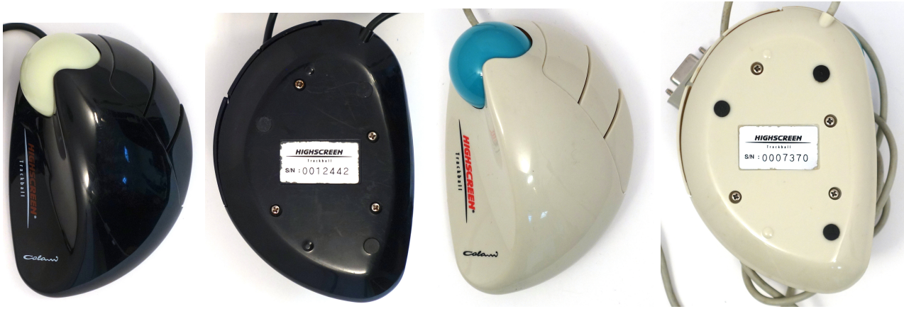
Figure 2: Colani Trackball, top and bottom views

special difficulties. However, judging by some signs, Luigi Colani himself did not resort to this method of shaping.