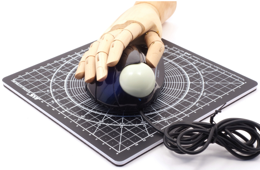
Figure 4: Colani Trackball with a human hand model