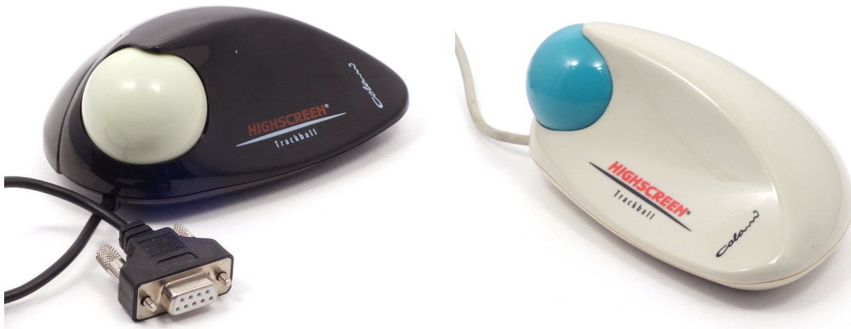
Figure 1: Colani Trackball

Colani is best known in the automotive industry, with about 40 concept cars; no less actively he designed furniture, household items, household appliances. And Luigi Colani’s fruitful collaboration with the German company Vobis Microcomputer, the owner of the Highscreen trademark, led to the release of several personal computers, joysticks, mice and trackballs based on his design.