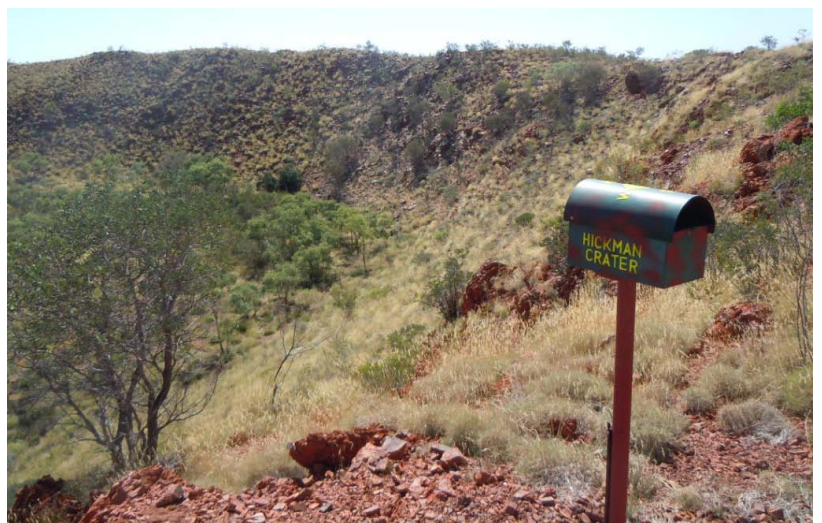
Figure 4: Eastern wall and rim of the crater, with letter box.

The Hickman Crater is almost circular (Figure 1), with a rim diameter of 250-270 m (average 260 m). The northern, eastern and southern rims, about 70% of the crater circumference, are uplifted 15-20 metres above the surrounding plateau surface and 20-30 m above the flat crater floor. The inner walls form steep, unstable slopes with numerous fallen blocks on the slopes and around the base (Figure 2 and Figure 4). Around the rim, bedding in the iron formation and crude flow layering in the rhyolites have been disrupted, steepened and in places overturned. Beyond the upturned rim,