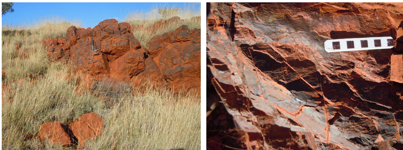
Figure 8: 8a - Outcrop of typical Boolgeeda Iron Formation; 8b - Fracture cleavage and lineation on cherty BIF. Scale is in centimetres.

The low hills are entirely of rhyolite blocks, some of them car-size, that could be outcropping bedrock, but are more likely to be large masses of ejecta. In the hills further west, above a small creek, outcrop of flaggy BIF and ferruginous shale of the Boolgeeda is covered by ejecta fragments of both BIF and rhyolite. Look for pre-impact folds, cleavage and lineation. At MGA 273290E 7446600N fracture cleavage and lineation are well developed in thinly bedded (strike 300°/20° S) cherty, in part jaspilitic, BIF (Figure 8a, b). From here there is a good view north into the valley of the pre-impact creek system that drains southeast into the crater (Figure 9).