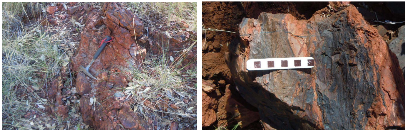
Figure 7: 7a – Brecciated BIF in rejuvenated creek below “spillway”; 7b – Boulder (ejecta?) of BIF with Fe-rich vein. Scale is in centimetres.

The view to the south of the larger east-draining creek illustrates the low cliffs forming a gorge in Boolgeeda Iron Formation, typical of this region, which would be similar to that postulated for the north-south creek destroyed by the impact. BIF ejecta become more abundant as you descend the creek, and eventually the creek crosses BIF outcrop. Some of the BIF is weathered and brecciated (Figure 7a. MGA 774900E 7449630N), and 10 m further south boulders of BIF have slickensides and cross-cutting 2-3 mm veins that could be pseudotachylite (Figure 7b).