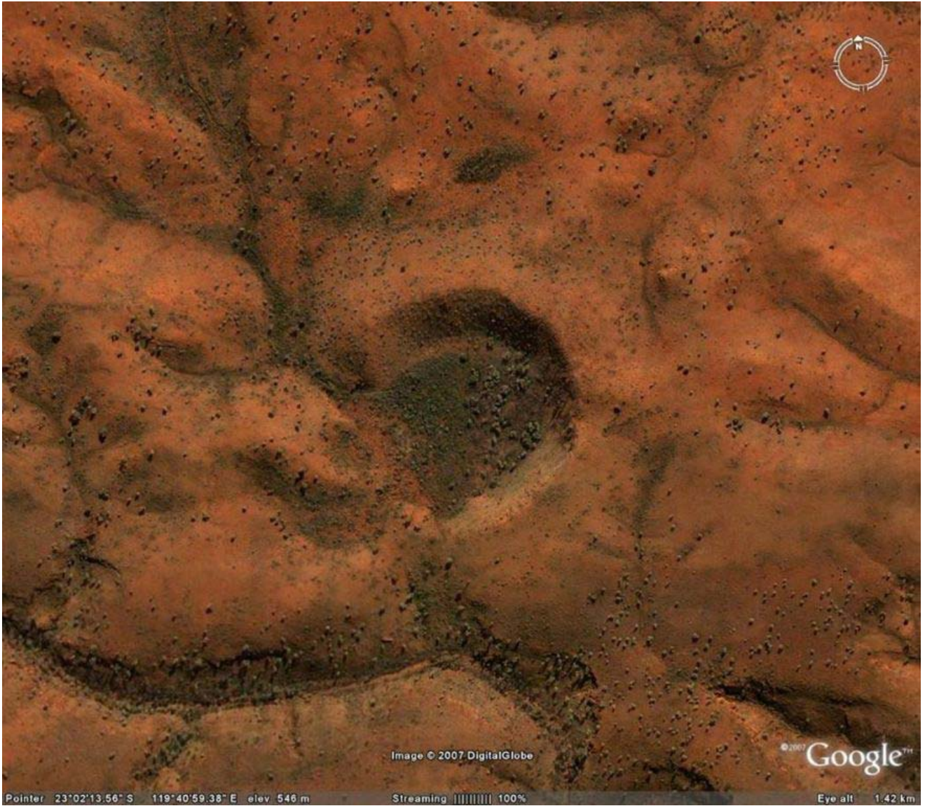
Figure 1: The “discovery” Google Earth image of the Hickman Crater. The crater is around 260m in diameter.