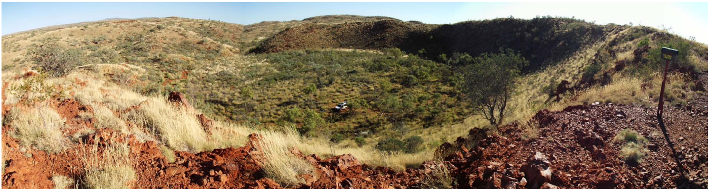
Figure 2: Panorama of crater showing low hills of ejecta in SW (left-hand side). Note four-wheel drive vehicle for scale.

During a field visit to prepare for this excursion further evidence, possibly more diagnostic, for an impact origin was found, but this still needs confirmation by laboratory work.