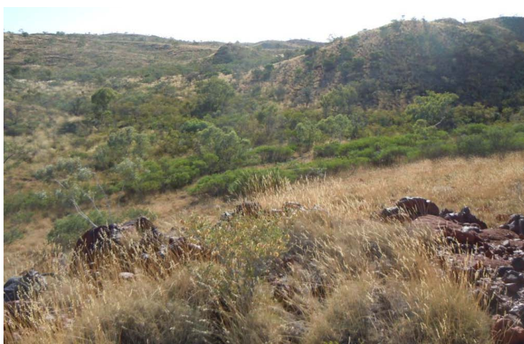
Figure 9: View to NE from Figure 8a, showing SE-draining creek and, at right of picture, the abutment at the western end of the northern crater rim.

The creek here has cut a course between abutments of rhyolite, some of which may be outcropping upturned bedrock, but some is certainly blocks that have fallen down the slope. The narrow course of the creek has cut down into rhyolitic bedrock through about 1.5 m of crudely bedded pebbly alluvium.