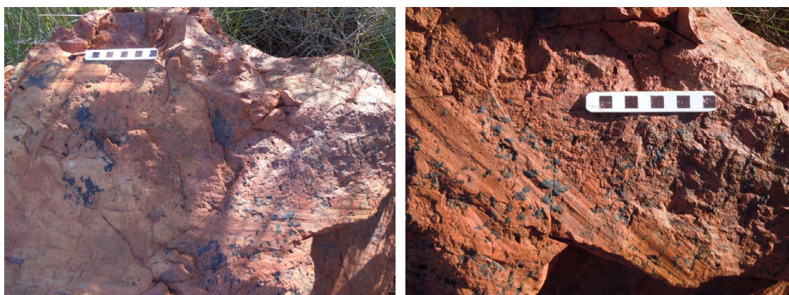
Figure 10: 10a – Fallen block of fractured rhyolite with slickensides; 10b – Detail from 10a, showing slickensides and black ferruginous coatings. Scale is 10 centimetres.

On the northeast side of the creek at the bottom of the inner wall of the crater, look for a large block of rhyolite that has fallen from the crater wall (Figure 10a. MGA 774754E 7449687N). The block features numerous slickensides and complex fracturing. Note also the black iron-rich coatings, of unknown composition and origin but post-slickensides and perhaps related to post-impact weathering (Figure 10b).