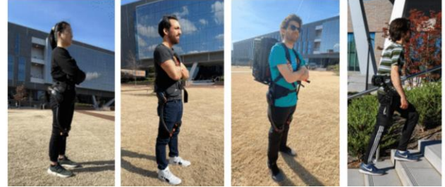
Fig. 2. Portable QDD Hip Exoskeleton Systems for mobility augmentation.

This work is in part supported by NIH under Grant R01EB029765, in part under National Science Foundation Future of Work under Grant 2026622. Any opinions, findings, conclusions, or recommendations expressed in this material are those of the authors and do not reflect the views of the funding organizations.