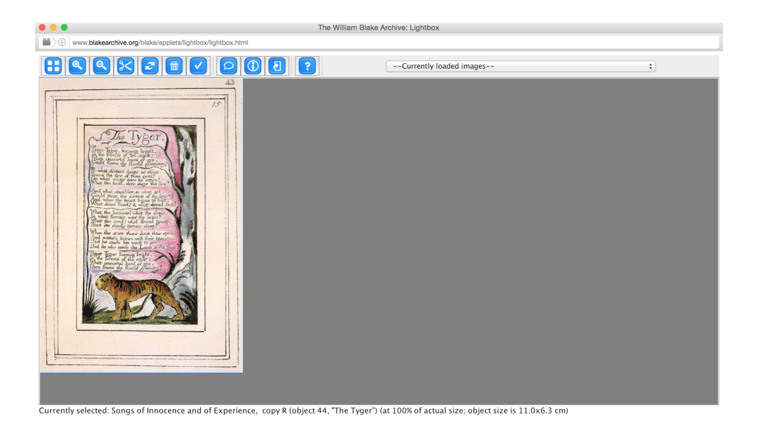
Fig. 4: The WBA's Virtual Lightbox applet, containing one image.

One final tool that that warrants discussion is the 'Virtual Lightbox' applet (see Fig. 4). This Java-based application allows users to collect objects from around the site, and then manipulate and study them within a virtual workspace. Key features include the ability to: