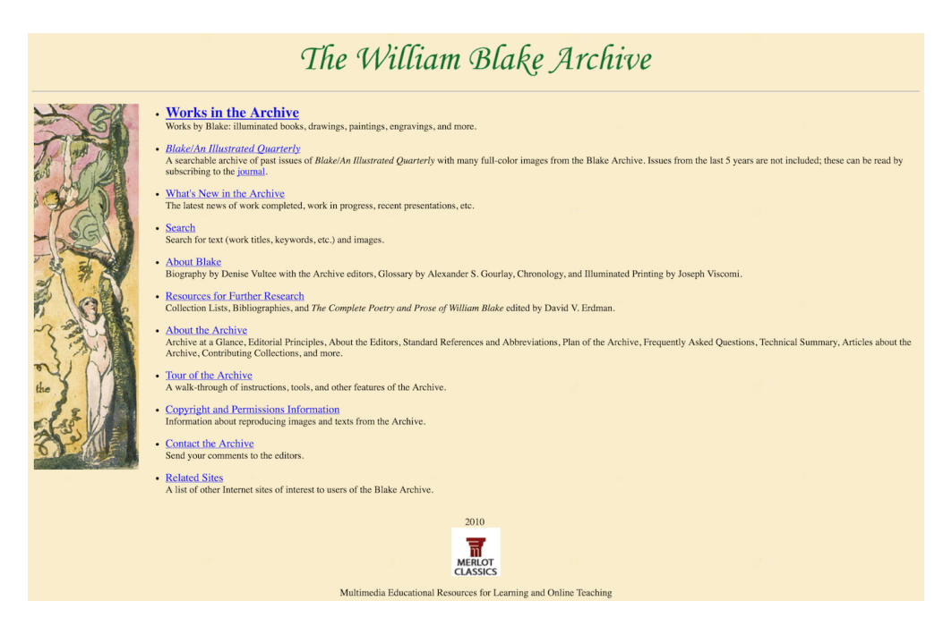
Fig. 1: The William Blake Archive homepage.

The electronic images that make up the WBA's fundamental archival units are encoded using a Document Type Definition developed by the Text Encoding Initiative (TEI). All textual information attached to these entries are encoded in XML and stored in a native XML database powered by eXist. A complex set of XSLT stylesheets transforms these XML documents into HTML, delivered via the Apache Cocoon Web development framework.