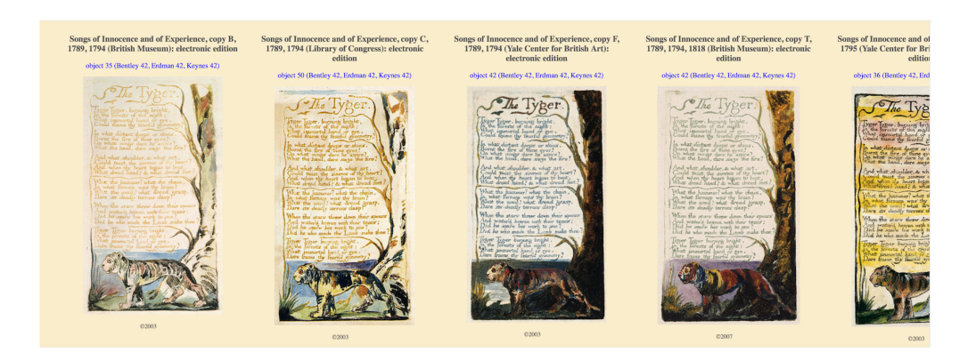
Fig. 3: The 'compare objects' feature.