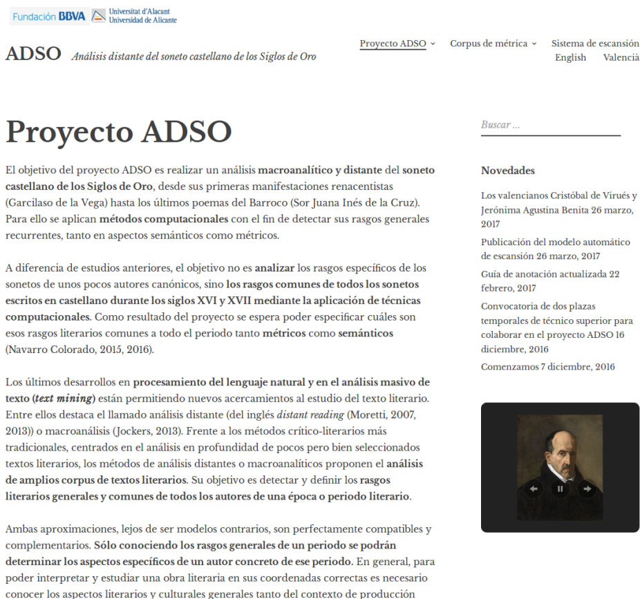
Fig. 1: Website of the project.

Spanish Literature like Cervantes, Lope, Quevedo, Tirso, Calderón, Góngora, etc. The sonnet represents one of the most important lyric genres of this period.