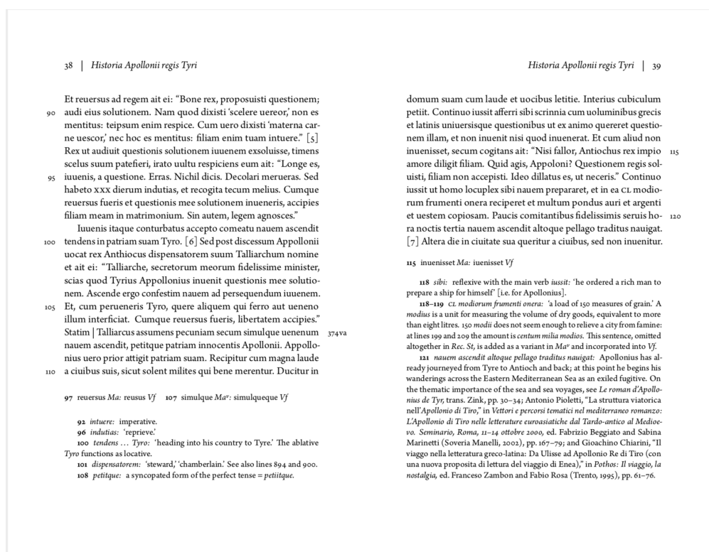
Fig. 1: Toronto Medieval Latin Texts edition and commentary, typeset using Reledmac.

2 There is not yet a reusable solution to editing texts in such a technology-independent form, but one of the key pieces in this puzzle has existed for decades: software for automatically typesetting texts with a scholarly apparatus. Maïeul Rouquette's Reledmac, a package for the venerable LaTeX typesetting system, has emerged as a readily available program that, used correctly, can produce professional results. A non-comprehensive bibliography lists almost seventy publications that have used it with a multitude of languages, including contributions from leading scholars (Wujastyk and Rouquette 2013). Although the package's gestation over more than three decades has resulted in some quirks, the wide support for LaTeX and its portability to nearly any system has made Reledmac's adoption possible by several digital editing projects, showing its potential as a key piece of scholarly infrastructure.