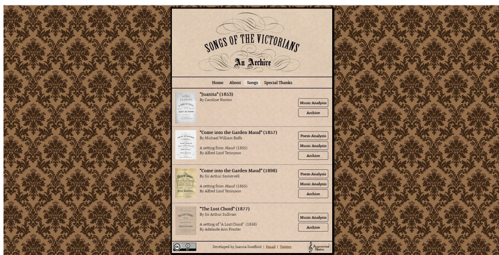
Fig. 1: View of ‘Songs’, with the complete list of pieces currently included in the project.