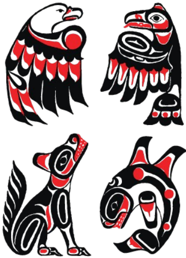
Illustration 1: Figure ⑦: Kitsap / Xai'xais "The First Nations community of Klemtu in the heart of the Great Bear Rainforest."

For more info on the artwork sources, adaptations, and the use of symbols among various First Nations, see: https://ecosteader.com/tags/indigenous