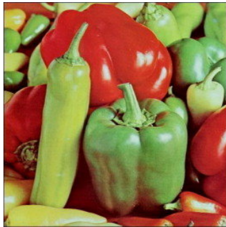
Figure 2.1: peppers.jpg

Decrease numerical precision to speed up the computation. Create a 3x3 box blur kernel and apply it to the image: