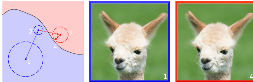
Figure 1: Illustrative example of an evasion attack for a binary classifier, that changes the output from blue to red. Our new attack framework exploits knowledge of the certifications (circles) to minimise the number of iterative steps required.