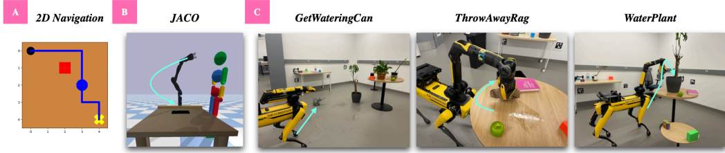
Figure 2: We evaluate on both simulated and real-world domains with a variety of missing features. A: 2D maze navigation, where the robot must navigate to a goal while interacting with other objects. B: 7DoF JACO manipulation, where the JACO arm must manipulate a held coffee mug while respecting features like end effector orientation . C: Spot mobile manipulation tasks, where the robot must complete tasks like WaterPlant while respecting the height of pot .