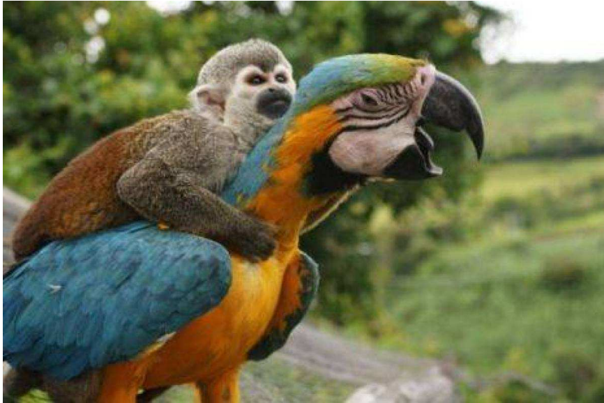
Figure 3: A monkey riding a parrot.

Tables. Tables are special figures in the sense that they are not written between curly brackets. Tables must be written using box drawing Unicode characters. Columns must be separated by a vertical light box drawing character. The first row separator must contain double box drawing characters, and the following ones must be separated by light double box drawing characters. The following is an example of table.