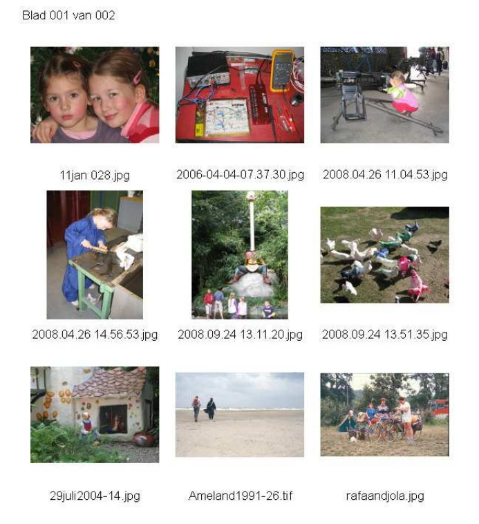
Figure 1: Example of contactsheet.

Figure 1 shows an example how such a contactsheet looks like. Each image is with an adjustable margin around the image<sup>1</sup> and symmetrical put in a minipage. The size of a minipage depends on the number of pictures per row. The filename to the image are centered printed. If the filename is very long, the filename scaled so that it falls within the minipage.