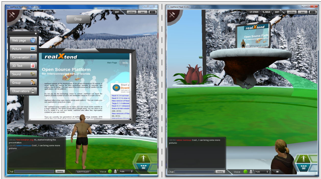
Two Naali clients stand nearby and view the presentation stage of the TOY system, an open source learning environment for the Future School of Finland project. The one on the left just added a web page to the stage, and is currently carrying the object.

No matter how the presentation view is made, the presenter typically needs the same controls. In Second Life, avatar controls are fixed and, to control a presentation, one might need to create a presentation sequence object with mouse click controls to press virtual buttons. In realXtend, custom controls in the client can directly change the shared scene state.