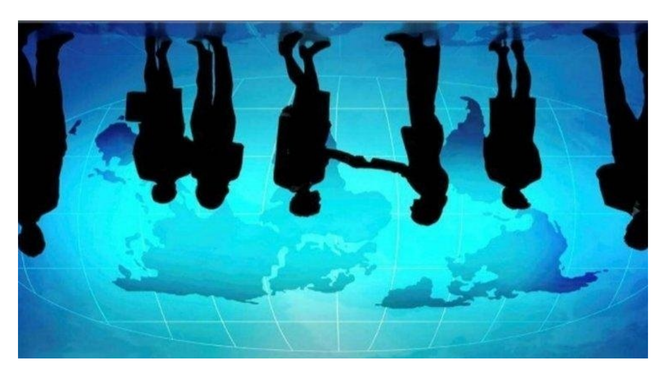
Published on April 26, 2017 on LinkedIn