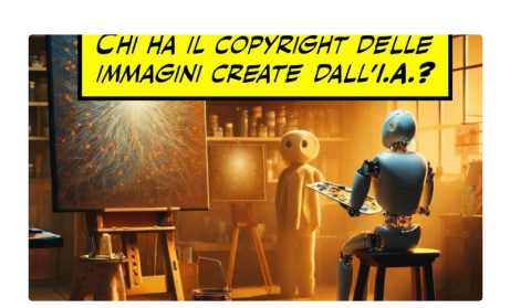
L'umana natura del diritto d'autore