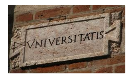
Wikipedia vs Università May 10, 2024