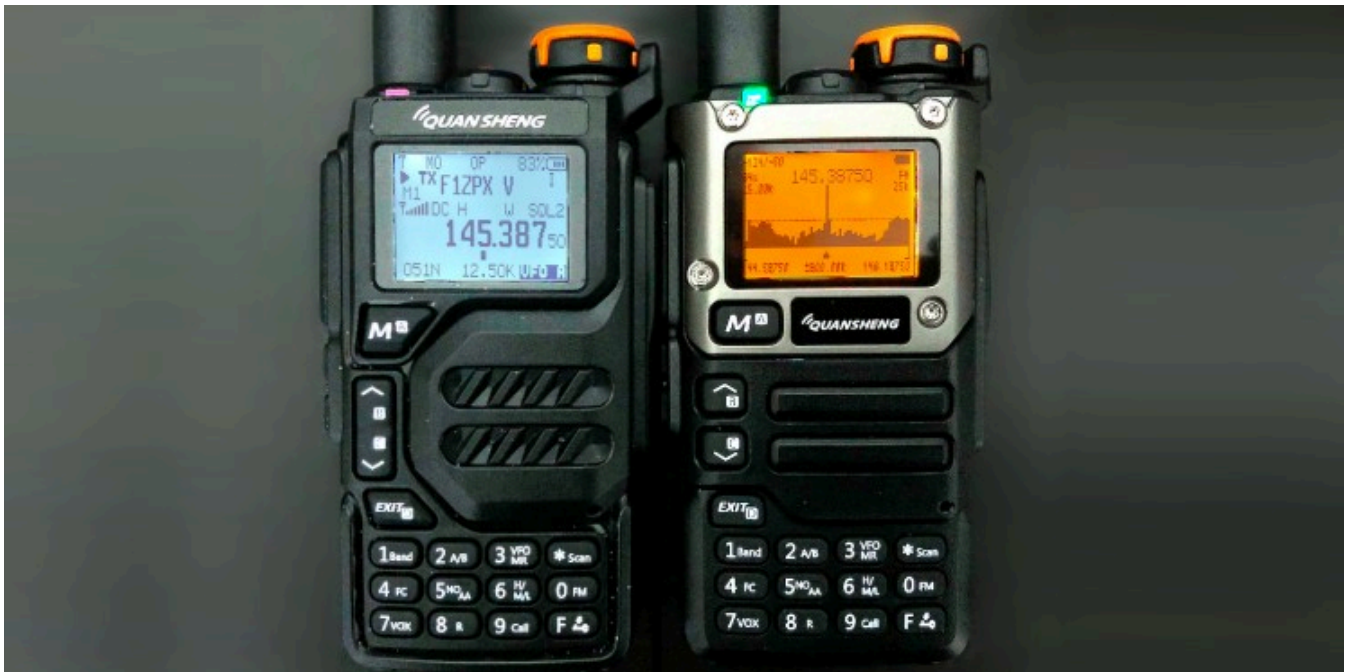
Quansheng UV-K5 and UV-K6 with F4HWN custom firmware

Quansheng UV-Kx radios are not professional quality transceivers, their performance is strictly limited. The RX front end has no track-tuned band pass filtering at all, and so are wide band/wide open to any and all signals over a large frequency range.