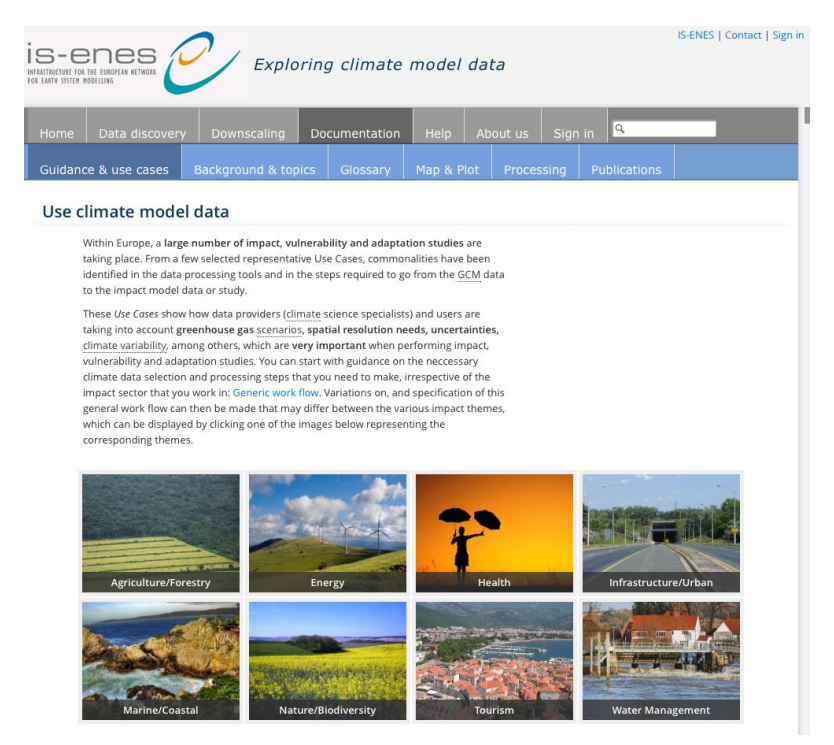
Figure 3: Documentation Tab with the themes landing page and with the sub-tabs. Basket

The basket is a personal space where links to files and resources, results of processing, and personal data files can be stored. The basket is accessible anywhere when logged in. By default there are two folders, 'Remote data' and 'My data'. Links from Catalogues like OPeNDAP links or file links are stored here. 'My data' contains processing results. In the next release 'My data' will offer secured OpenDAP in order to visualize and re-use datasets in further processing. Upload functionality will be added as well, this allows processing of your own files in climate4impact. One can think of uploading a point dataset and extract timeseries for this point dataset.