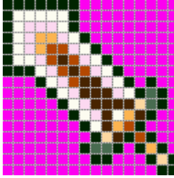
Figure 2.1: Pattern Example