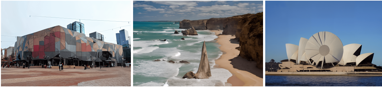
Figure 1: Examples of LSDvis based on Australian landmarks. Left: A bar chart of popular visiting times blended onto the facade of the Federation Square building. Middle: An area chart of visiting vehicle counts added as a rock in The Twelve Apostles. Right: A pie chart of revenue percentages blended into the shells of the Sydney Opera House.