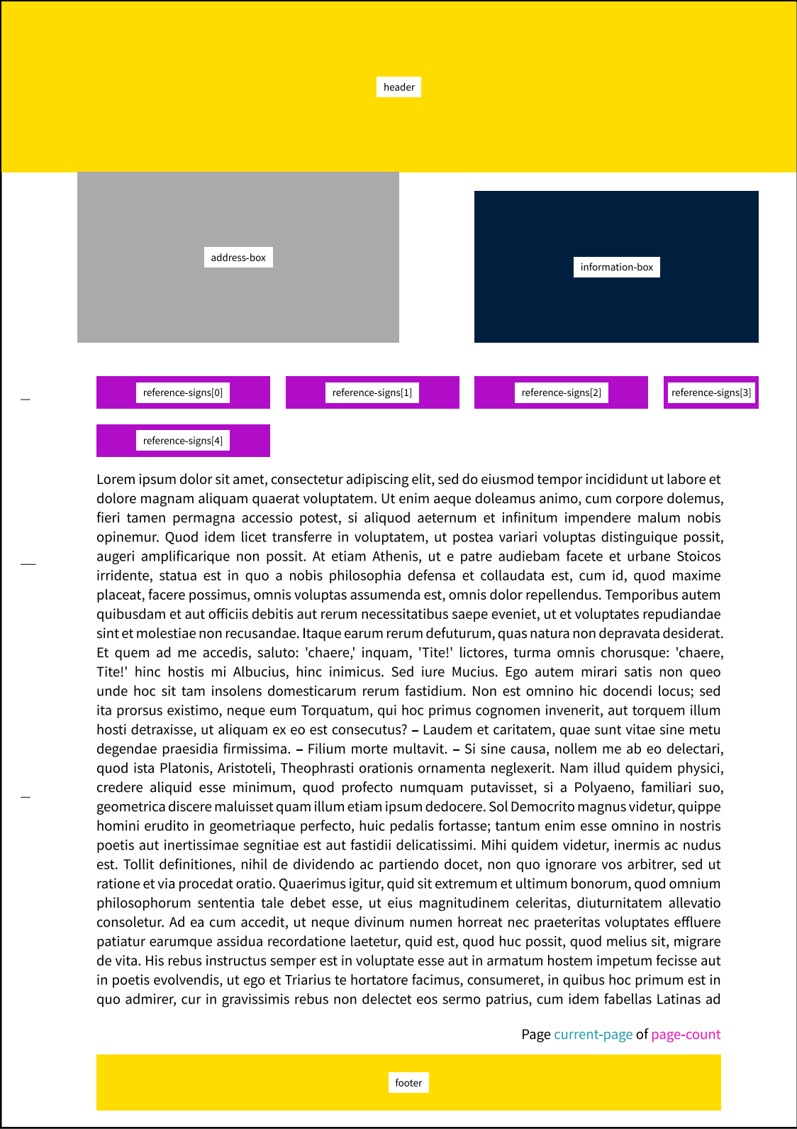
Figure 1: Page layout of letter-generic . Every layout option is highlighted.