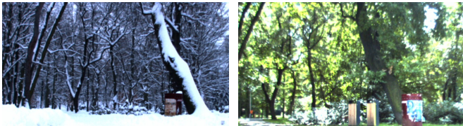
Fig. 2. Seasonal environment variations captured by the outdoor dataset.

To evaluate the usefulness of the approach, we apply it to the problem of visual-based localization in changing environments. Here, the environment representation is composed of several local maps that consist of collections of visual features visible at the particular locations. The visibility of the individual image features [16] over time is represented by FreMen, which allows to predict their visibility for a particular time and use the time-specific features for visual localization. The experiments were performed both indoors and outdoors. The indoor experiment was performed at Lincoln Centre for