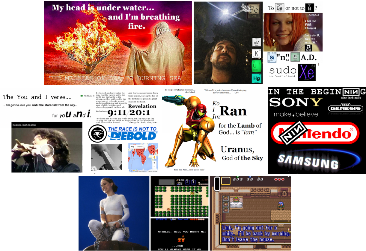
Somehow, this .... is Hyrule!